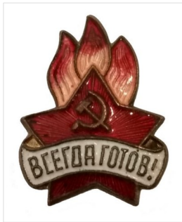
Young Pioneer badge: hammer and sickle design (c.1946-62).

In the year 1962 the All-Union Young Pioneer Organisation was awarded the Order of Lenin. In recognition, the emblem was redesigned. In the place of the hammer and sickle, the badge featured a portrait of the organisation's namesake, Vladimir Ilyich Lenin. The motto size was reduced and moved down to accommodate the portrait. This was the final version of the design in use until the breakup of the Soviet Union in 1991. 65