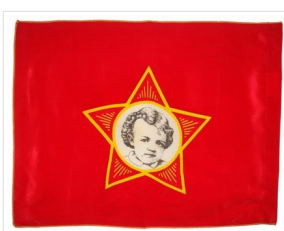
Little Octobrist badges and flag.

Once the child joined the Little Octobrists they became part of the proud tradition of the Soviet fight for the victory of communism. They wore the red