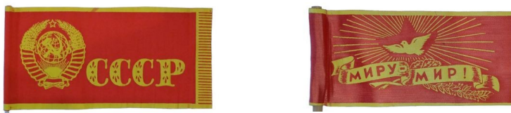
Little holiday flags: left, 'USSR' with arms; right, 'To the world, peace'. Author's collection

By far, most of the designs identified to date conformed to the national colours by using yellow or white printing on a red field. There are some examples with red printing on white, but these are the minority. Most designs use the Russian language for slogans, but examples also have been found with Latvian text. Thematically, the flag designs draw from the official state symbol set, illustrate Red Square and the Kremlin as the centre of Soviet civil religion, have Revolutionary and paramilitary themes, celebrate the Soviet space programme, display themes of peace and friendship, and reinforce the idea of a peaceful happy childhood. 80