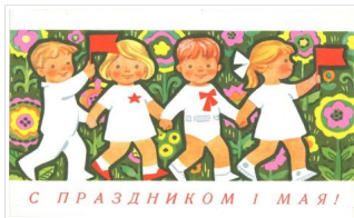
'4 Little Octobrists': May Day postcard; E. Ioffe, artist (Moskva: Sovetskii khudozhnik, 1968). Author's collection

And you should go outside with your little flag. Let the Earth be even more red. 76