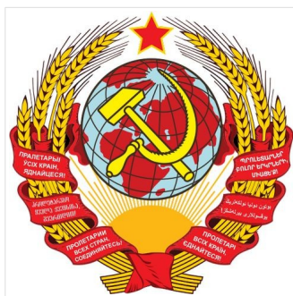
State Arms of the Union of Soviet Socialist Republics (1st version, 1923-36). https://commons.wikimedia.org/wiki/File:Coat_of_arms_of_the_Soviet_Union_(1923%E2%80%931936).svg [accessed 2 June 2017]

In Russian, the state emblem of the Soviet Union is usually described using the traditional word for 'coat of arms' – герб ( gerb ), even though the design intentionally deviated from the heraldic standards for coats of arms. The Soviet emblem signalled a new style of socialist heraldry that had evolved beyond the coats of arms traditionally used to represent the nobility and their domains. In place of an escutcheon (or shield), the Soviet arms used the globe of Earth depicted above the rising sun, symbolising the dawn of a new era. The globe tilted to show Eurasia, the location of the Soviet Union, with the African continent below. A gold (or yellow) crossed hammer and sickle emblem covered the landmasses of the globe. The red star served as a crest, in the position once reserved for the royal crown in the heraldic tradition of the Russian Empire. Instead of the traditional supporters on either side of the shield, the Soviet emblem used a wreath of grain, tightly wrapped in a red ribbon.