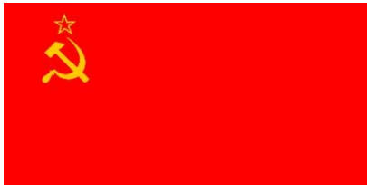
National flag of the Soviet Union. https://flagspot.net/images/s/su.gif [accessed 23 June 2017]

This hat badge was also the origin of the Red Star – Красная звезда ( krasnaia zvezda ) as a symbol of the Soviet Union in particular, and of international communism in general. The five points of the star represented the five populated continents – Eurasia (considered to be one continent in Soviet usage), Africa, North America, South America, and Australia. In Soviet Communism, the theory was that through the natural progression of social evolution all nations will eventually become Communist and the Proletariat of all nations will eventually be victorious in their struggle. 36