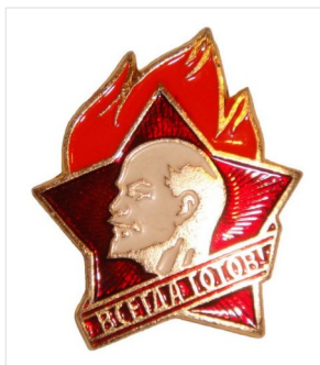
Young Pioneer badge: Lenin design (1962-91).

In the year 1962 the All-Union Young Pioneer Organisation was awarded the Order of Lenin. In recognition, the emblem was redesigned. In the place of the hammer and sickle, the badge featured a portrait of the organisation's namesake, Vladimir Ilyich Lenin. The motto size was reduced and moved down to accommodate the portrait. This was the final version of the design in use until the breakup of the Soviet Union in 1991. 65