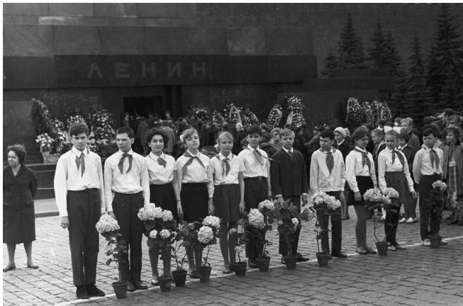
Young Pioneers before the Lenin Mausoleum.

Pioneer rituals. It was a favourite location for children to visit in order to lay flowers or wreaths in honour of Lenin. The sacred nature of the mausoleum extended well into the square, adding an extra element of solemnity to the Pioneer induction ceremony or the ceremony in which Young Pioneers joined the Komsomol. And, of course, there was also the importance of Red Square for the parades and mass demonstrations associated with May Day and the anniversary of the October Revolution. All of the practices ensured that the Lenin Mausoleum, Red Square, the Kremlin, and Moscow itself, would be understood as the focal point of the Soviet citizen's world view, and the ultimate destination in their practice of the rites and observances of Soviet civil religion.