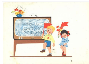
'2 Little Octobrists': May Day postcard; V.I. Zarubin and S.K. Rusakov, artists (Moscow: Ministerstvo svyazi SSSR, 1964).

These readings are similar to those found in textbooks, and clearly illustrate the major themes of the May Day holiday – it is a celebration for all the workers of the world (not just the people of the Soviet Union) and it is a holiday focused on peace. It is also clear to the child that on this day all citizens should participate either as official marchers in the mass demonstrations that were held in every Soviet city or as part of the large crowds that gathered to watch the parades.