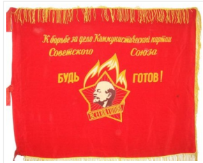
Young Pioneer group: banner (1962-91).

been awarded to the organisation in 1962 and 1972. This very special banner was used at All-Union Pioneer rallies and was carried at the head of the flag group when the Young Pioneers paraded on Red Square. 66