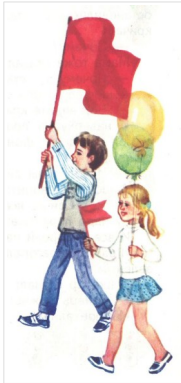
Left, children march with flags. Azbuka, p. 171