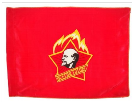
Young Pioneer detachment: flag (1962-91).