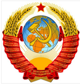
State Arms of the Union of Soviet Socialist Republics (4th version, 1956–91). https://commons.wikimedia.org/ wiki/File:State_Emblem_of_the_ Soviet_Union.svg [accessed 2 June 2017]