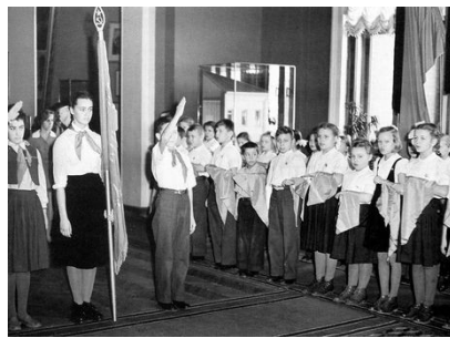
Young Pioneer induction ceremony.

Value your scarlet Pioneer neckerchief. Wear it every day and always act such that no one can reproach you as unworthy to wear it. 68