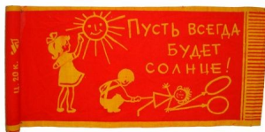
Left and middle, 'Let there always be sunshine!'; bottom left, the sun; bottom right, the Pioneer flame

May there always be sunshine, May there always be blue skies, May there always be my mama, May there always be me!