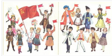
Below, children celebrate the 'Unbreakable Union of Freeborn Republics'. Azbuka, pp. 190-91

Many of the themes from the alphabet book can be found in another early reading book by the same authors intended for children in the first grade, entitled 'We Read' – Читаем сами ( Chitaem sami , 1982). On the cover of the book are two children wearing school uniforms and Little Octobrist membership pins. They are working together to read a book. Texts in the book teach the children about the qualities of the Little Octobrists, who 'live cheerfully in friendship,' 'read stories and guess riddles,' 'draw with pencils and paints,' and 'know many amusing games'. There also is a story about 'Moscow – the Mother of All Cities':