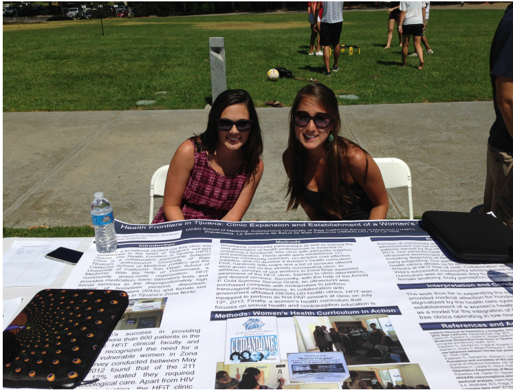
HFiT Grab-n-Go Breakfast Fundraiser