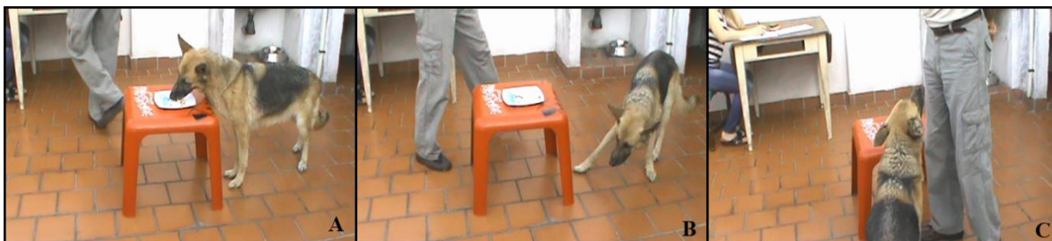
Figure 1. Image of the generated conflict. (A) The dog is taking the human food from the plate. (B) The target owner (O1) is scolding the dog. (C) The owner remains looking fixedly at the dog during 30 s after the scolding.

During testing there were two owners present, as well as a female experimenter who filmed the dogs' behavior. We also place a steady camera on a tripod to capture the whole situation. Both cameras were SONY DCR 308 and dogs behaviors were analyzed afterwards from the videos collected (see Data Analysis).