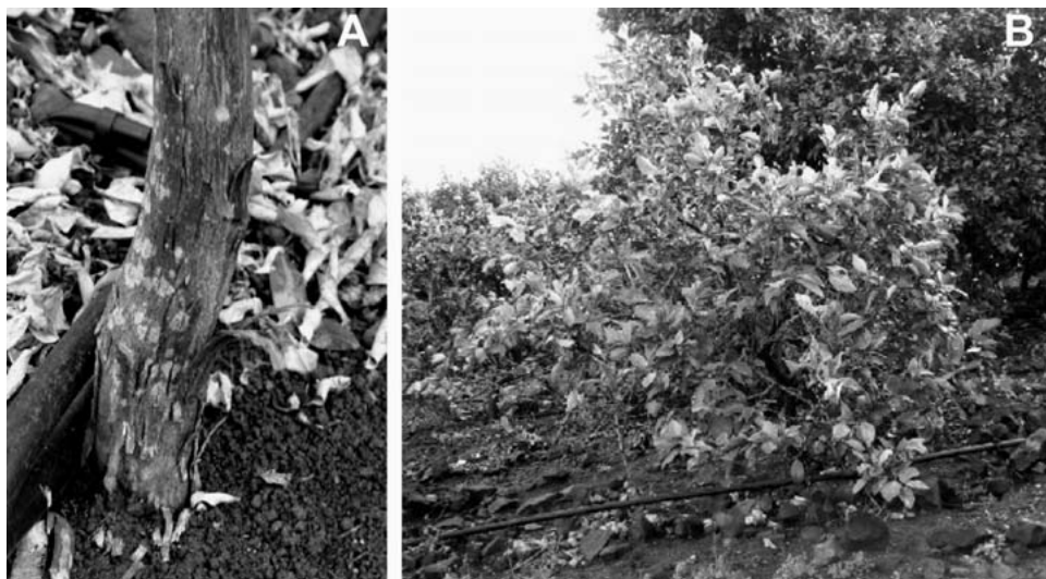
Fig. 2. Symptoms on 'Rubidoux' trifoliate orange inoculated with a citrus viroid complex (inoculum 3). A) Severe bark scaling symptoms, and B) yellowing of leaves.

HSVd in inoculum 2 was not perceptible in sPAGE, it gave a positive signal with CEVd, CBLVd, HSVd and CVd-III probes. None of the inoculum sources was positive for CVd-IV. It should be noted that the intensity and mobility of HSVd in inoculum 2 differs from that of HSVd in inoculum 3. Similarly, CVd-III in inoculum 2 presents a lower mobility than CVd-III in inocula 1 and 3. These differences suggest that they differ in size and/or nucleotide composition.