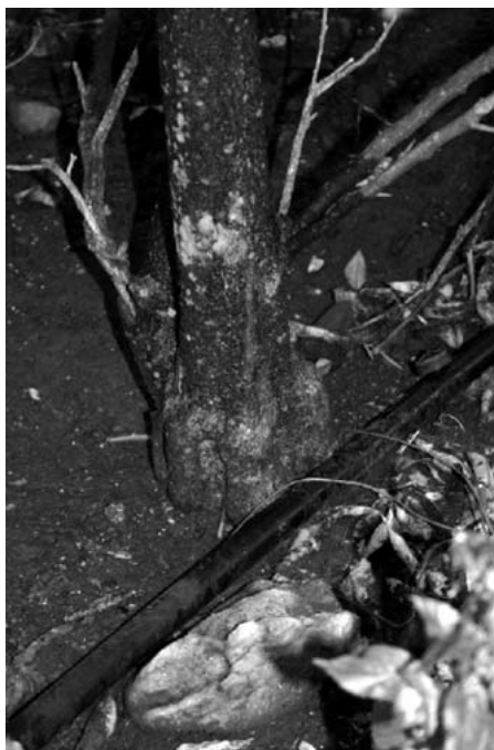
Fig. 3. Trunk of BA300 citrange rootstock inoculated with a citrus viroid complex (inoculum 3). No bark scaling symptoms are visible on this rootstock.

rizo citranges varied depending on the inoculum source. This observation indicates that viroid sources