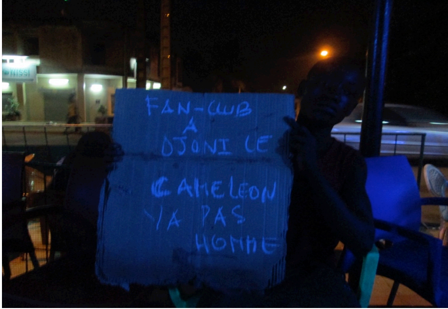
Image 3.6. Children with sign outside of Maquis Pitch (image taken by author)

I found street children dancing at the gate of the maquis, as they were restricted from entering the seated area that was limited to paying customers. After the DJ left and the crowd began to dissipate, the children continued dancing and drinking the remaining beer, soda, and food left by former patrons. As they finished off the bottles, I gathered (after asking their permission) those who were still sober together and asked them about their lives on the street. Ironically, unlike previous interactions with street children who appeared to be fearful when I asked to interview them, these children calmly sat down and upon seeing my audio recorder asked if I was a journalist. I asked each several questions about their lives.