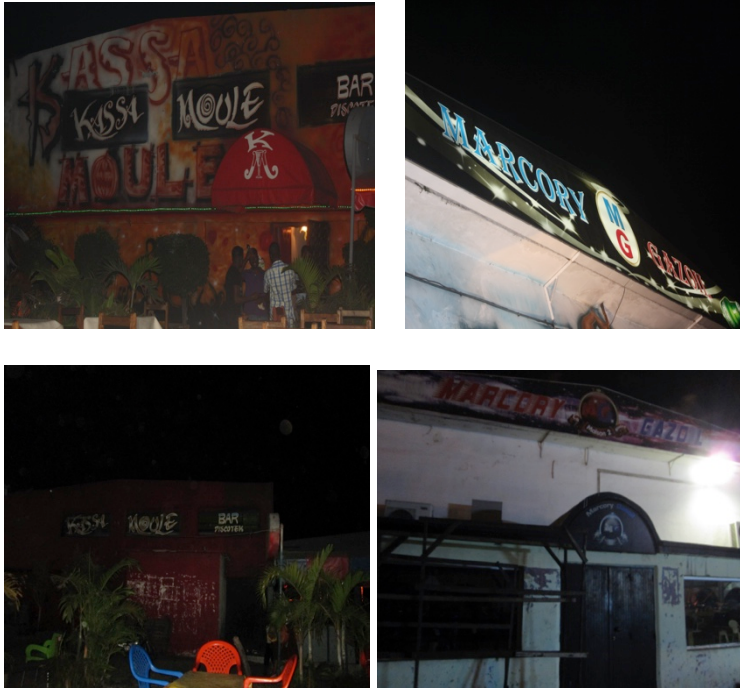
Image 3.5. Before and After Image of Mille Maquis