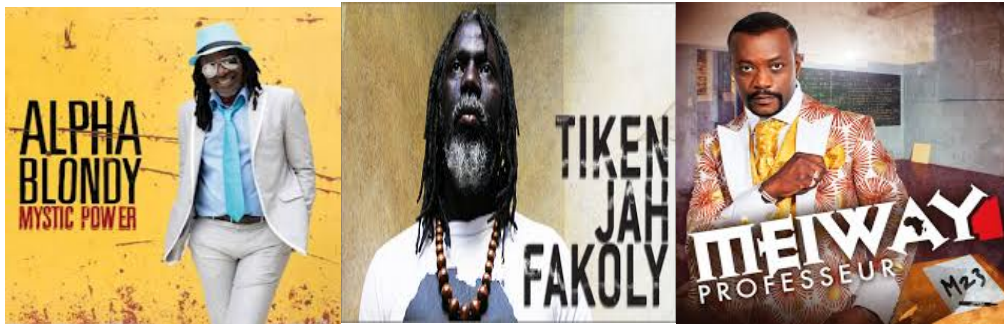
Image 5.10: Alpha Blondy ( Mystic Power , 2013); Tiken Jah Fakoly ( African Revolution , 2010); and Meiway ( Professeur , 2012b)

The three leading acts of the Caravan demonstrate the diverse ethnic, regional, and religious makeup of the nation. Reggae artist Alpha Blondy was born to a Christian mother and Muslim father, yet was raised in a household, where he was taught “to love everyone,” in Dimbokro, near central Cote d’Ivoire. Tiken Jah Fakoly, also a reggae artist, is a practicing Muslim, who was raised in Odienné in northwestern Cote d’Ivoire. And, lastly, popular artist Meiway was born in a Christian household in his Nzema village in Grand Bassam in southeast Côte d’Ivoire. These artists merely represent some of the top performers on the tour. There were over three hundred acts representing musical genres, styles, ethnicities, and religions from across the nation.