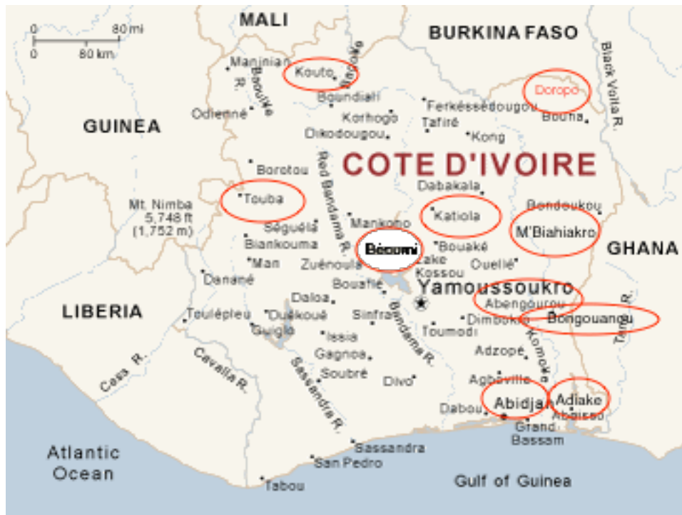
Image 5.7. Map of Côte d'Ivoire with cities of each performance group circled. (mapsofworld 2016)

Each group represents cities from different parts of Côte d'Ivoire, including Abengourou, Touba, Katiola, Adiake, Bongouanou, M'Biahiakro, Kouto, Béoumi, Doropo, and quartiers of Abidjan, such as Jacquville, Treichville, Marcory. As seen in Image 5.7, these locales can be found across the nation, demonstrating that the performances offer a fair representation of the diversity within the country.