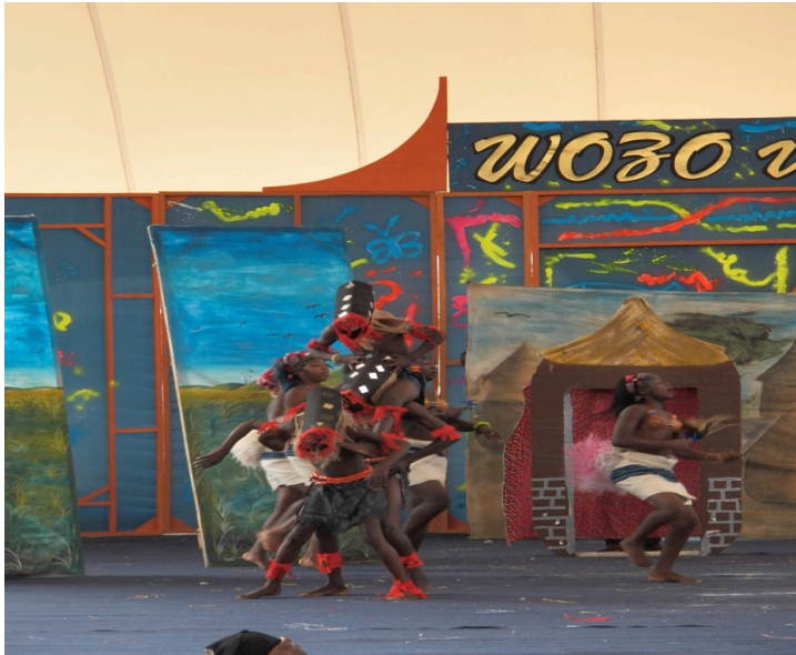
Image 5.6. Traditional Dance Segment Wozo Vacances with children performing a traditional Senoufo dance from northern Côte d’Ivoire

input and agency children give to the production, direction, and content of the shows that include a political message.