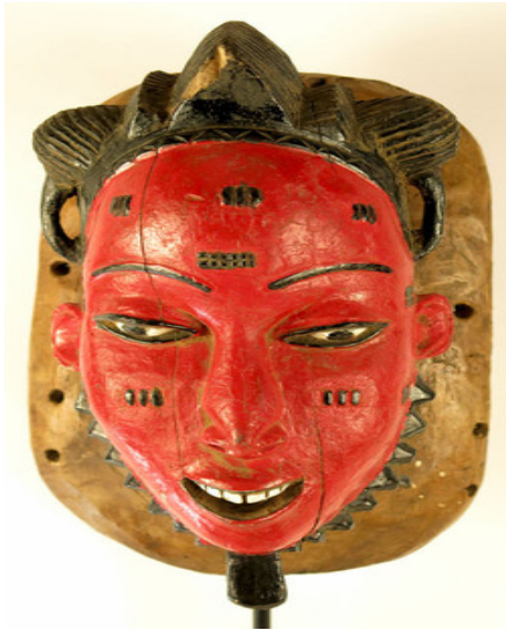
Image 5.8. Baule Red KpanMask (ArtTribal 2016) 101

along with the dundun and djembe that are Mande derived. Similarly, the playing technique—using hands or sticks--varied among groups, as seen in the above vignette.