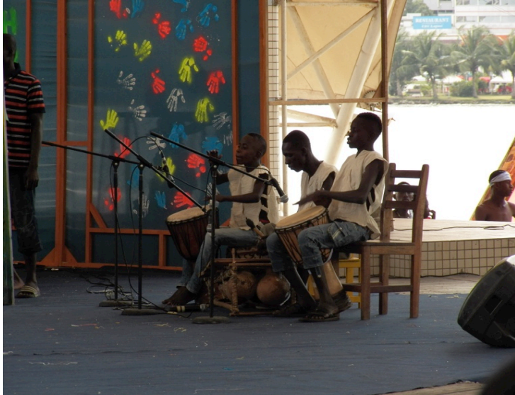
Image 5.5. Musicians playing Gur and Mande Instruments (djembes and balafon) for Wozo Vacances 91

When I observed the performance, nationalistic themes were prominent so much so that it was unclear if the topic was one episode, the season, or the entire show. Therefore I searched the network site and YouTube for older episodes.