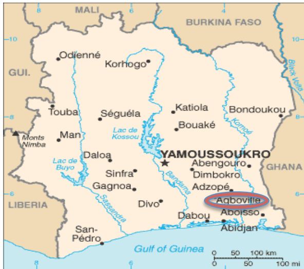
Image 3.7. Map of Agboville, Côte d'Ivoire (About Africa Travel 2016)

An excerpt from their interviews demonstrates the theme of rural-urban migration and the various reasons children leave their homes.