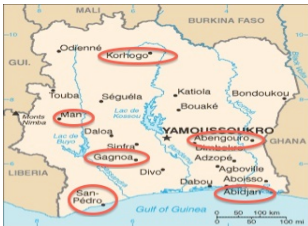
Image 5.9. Map of Côte d'Ivoire and concert locations (List of Cities in Ivory Coast 2016

In an effort to calm and reunite the nation after the political crisis of 2010 and 2011, President Alassane Ouattara advocated for Caravane pour la Paix et de la Réconciliation, which took place October 20 th through November 3 rd 2012. The government arranged for artists from various genres, ethnicities, and religions to perform in concerts in six major cities--San Pedro, Gagnoa, Man, Korhogo, Abengouro, and Abidjan--throughout Cote d'Ivoire (Image 5.9). 106