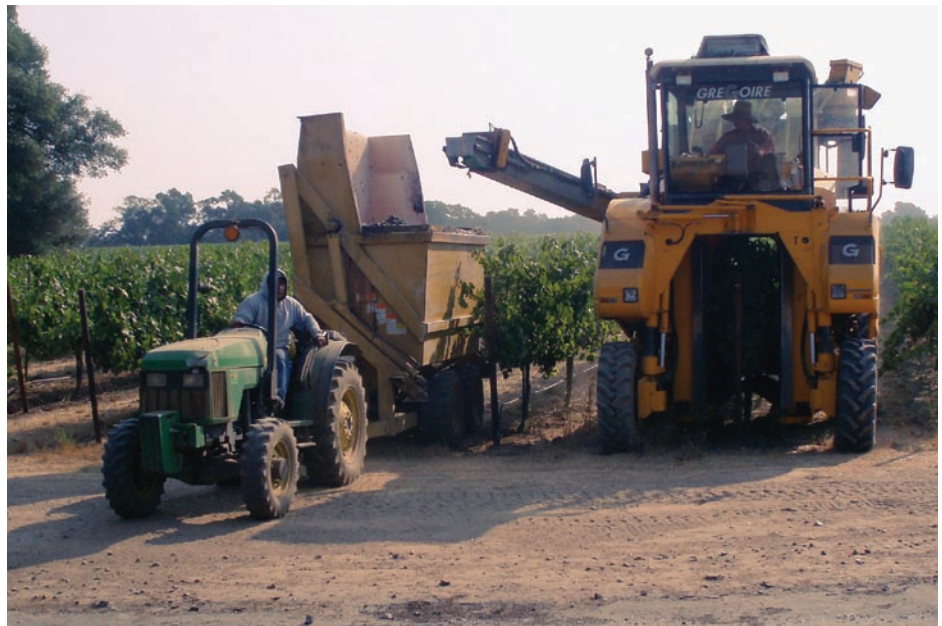
Lange Twins Winery, based in Acampo, credits the Lodi commission as "a catalyst in shaping our philosophy. We have developed our sustainable techniques through their guidelines."

The Farm*A*Syst workbook model had two attributes that other self-assessments, such as the Positive Point