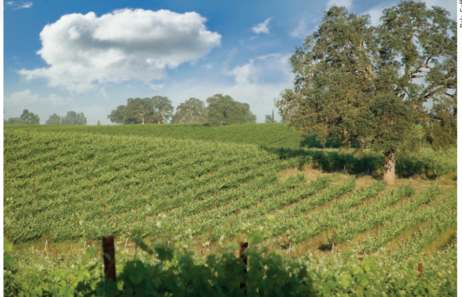
Growers in the Lodi region have embraced sustainable winegrowing practices since the early 1990s.

The California wine industry, relative to other U.S. agriculture sectors,