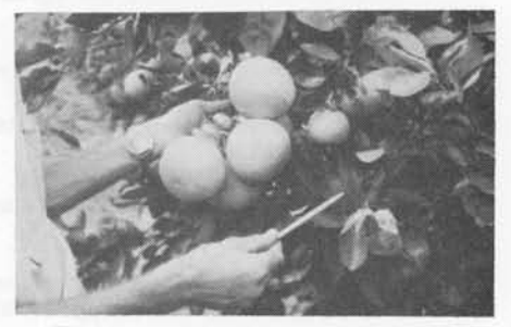
Fig. 2. Normal sized grapefruit being held next to the small fruit on a tristezaaffected grapefruit tree at Nkwalini.