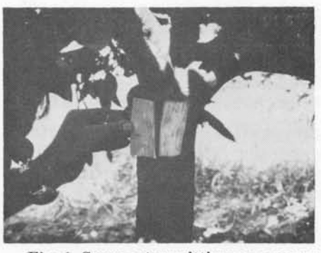
Fig. 1. Severe stem pitting on a young Redblush grapefruit tree at Nkwalini.

The symptoms of tristeza on these young trees include stunting, severe stem pitting (fig. 1), small fruit (figs. 2 and 3) and several small leaves with deficiency symptoms. A survey of the affected orchard showed that virtually all the 500 trees had developed these symptoms, while only 2.5% of the sister trees (i.e. propagated from the same parent tree) planted at