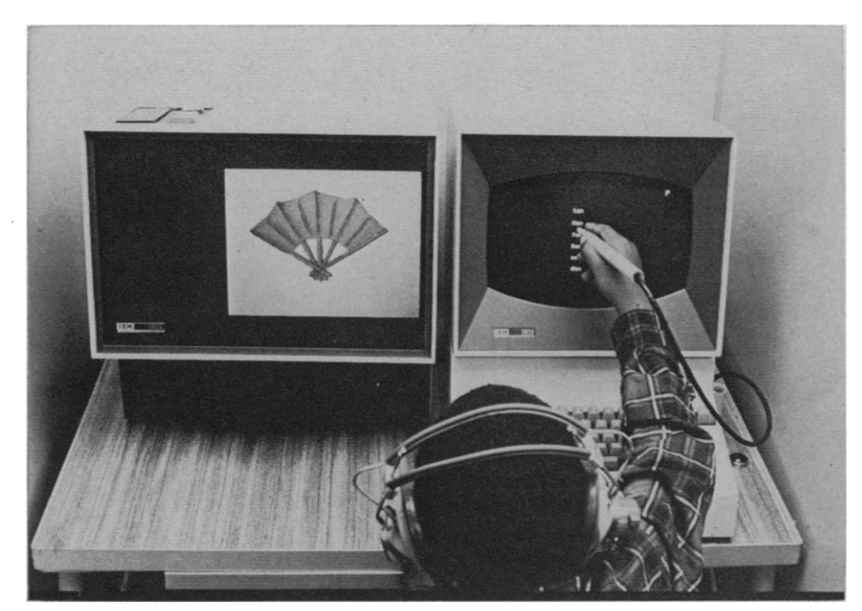
Fig. 1. Student terminal used for tutorial instruction in initial reading.

York at Stony Brook, and Harvard University. The University of California at Irvine, which is a relatively new university, has made a serious attempt from its earliest planning stages to integrate computer-assisted instruction into its total instructional program (2).