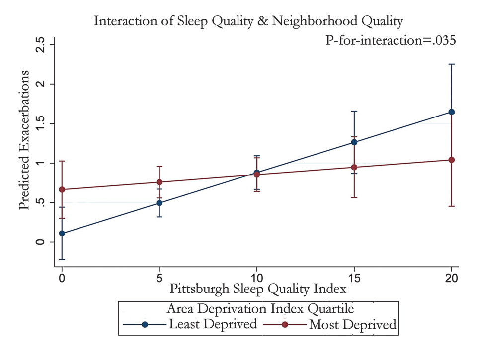
Figure 3. In the presence of worse neighborhood deprivation (in those in the highest quartile of the Area Deprivation Index [ADI]), baseline sleep bore little relationship to risk for exacerbations. Shown is a marginal effects plot demonstrating the predicted exacerbation count across the spectrum of Pittsburgh Sleep Quality Index (PSQI) scores at various, baseline ADI scores.

COPD exacerbations and the subset of exacerbations resulting in hospitalization. These findings highlight the importance of life circumstances in influencing disease control.