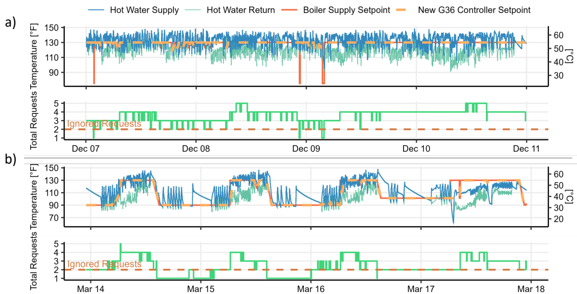
Figure 3 Example of Brick enabled ASHRAE Guideline 36 hot water supply temperature setpoint reset strategy during the (a) winter season and (b) during shoulder season when outdoor temperatures are milder. “New G36 Controller Setpoint” refers to the new calculated setpoint by the G36 control block and “Boiler Supply Setpoint” refers to the setpoint written in the hot water plant. The hot water plant is running continuously in both seasons.

Measurement and verification were not part of the scope for this field demonstration. The main objective of this research was to have a working software implementation that incorporates the four standardization projects mentioned in the background section above i.e. BACnet, Brick, CDL, and G36. However, we were able to access gas utility data to estimate the gas cost savings of implementing the new G36 controller for months December 2021 through April 2022. We calculated a range of 20% to 45% monthly cost savings when compared to the monthly average gas costs between those same months for the years 2017-2019 where the existing control strategy was used. Matching the boiler plant output with the demand of the hot water end-users allowed the boiler to increase efficiency during condensing mode operation. Natural gas boilers start condensing operation at a return water temperature of about 135 °F (57 °C) and their efficiency continues to increase the lower the return water temperature.