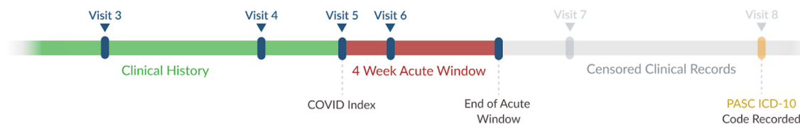
Fig. 1: Censoring protocol of patient records. All records available in the N3C enclave prior to (clinical history) and within 4 weeks after (4 week acute window) the COVID index date were available for use by the models. All records after the 4 week acute window were removed from the training and testing datasets. ICD-10-CM code U09.9 that occurred after the 4 week acute window indicated a patient with Long COVID.

The Hold Out Training Dataset 1 was available to participants during the model development phase (Supplemental Fig 1). This dataset provided a traditional random sample of the available data and contained 9031 cases, 46,226 matched controls, plus 2415 patients who