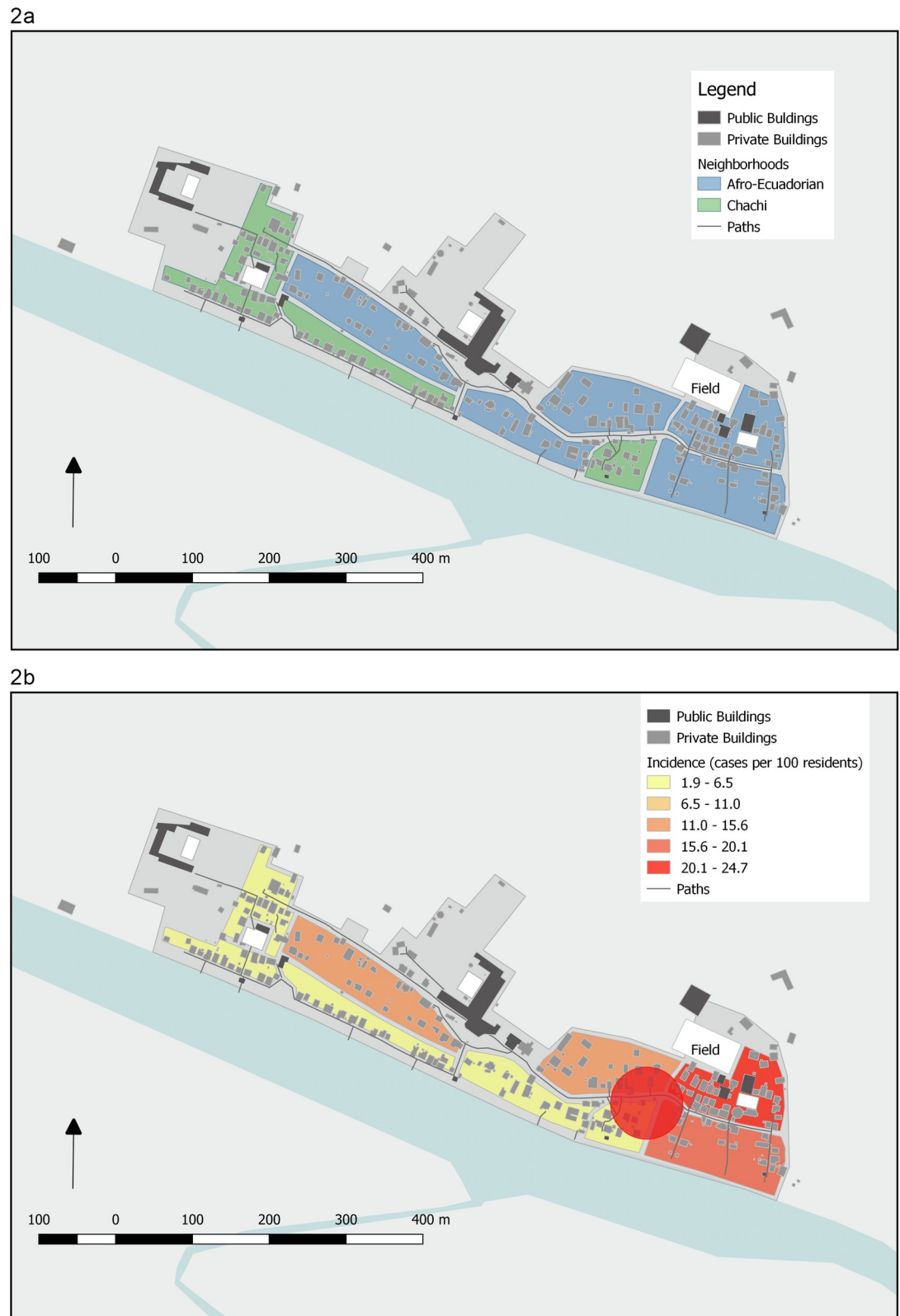
Fig 2. Community Map. The study community. 2a. Neighborhoods are coded by the reported ethnicity of the occupants. 'Field' represents the football field that represented a spatial risk factor in the outbreak. 2b. The red circle indicates the part of the community where Ae. Aegypti were identified. For privacy reasons, we do not identify specific households where dengue cases occurred, or where Ae. Aegypti were identified. These maps were constructed de novo by the study team.

https://doi.org/10.1371/journal.pntd.0009679.g002