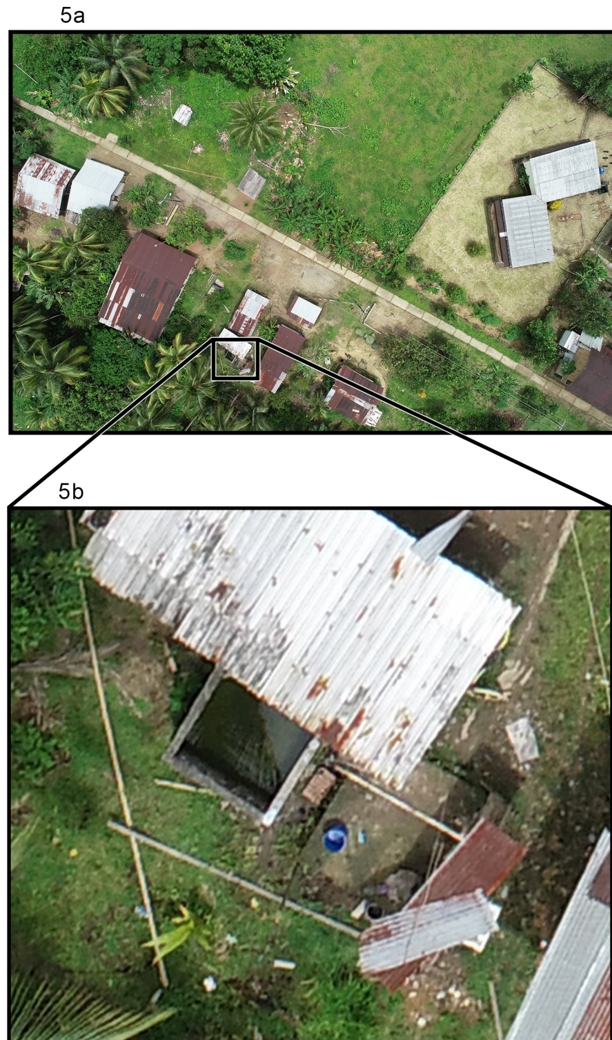
Fig 5. UAV images: Larger, outdoor potential larval habitats such as cisterns and rain barrels can be identified from UAV images (Fig 5A and 5B).

https://doi.org/10.1371/journal.pntd.0009679.g005