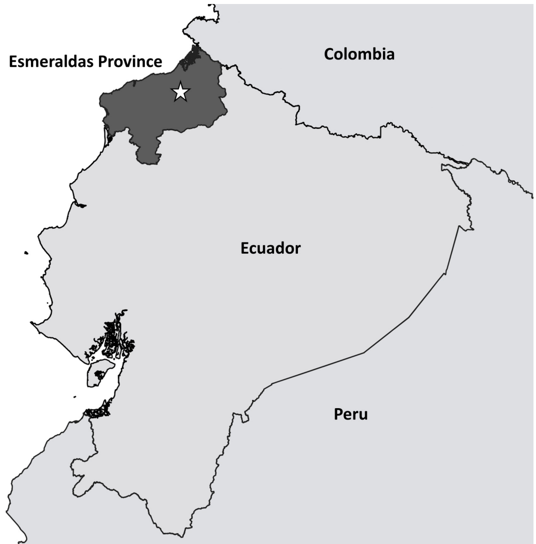
Fig 1. Map of Ecuador: The approximate location of the study community is indicated by the star. This map was constructed using shapefiles downloaded from https://data.humdata.org/ , which is available under a CC BY-IGO license ( https://data.humdata.org/dataset/ecuador-admin-level-2-boundaries ).

https://doi.org/10.1371/journal.pntd.0009679.g001