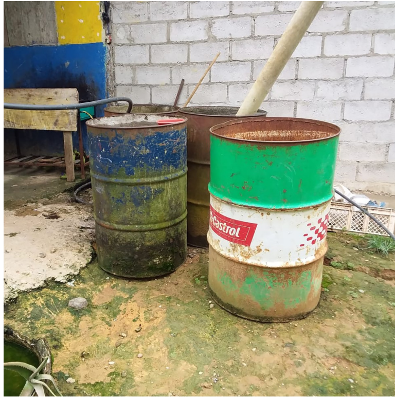
Fig 4. Outdoor rain barrels: A photo of an outdoor rain barrel.

https://doi.org/10.1371/journal.pntd.0009679.g004