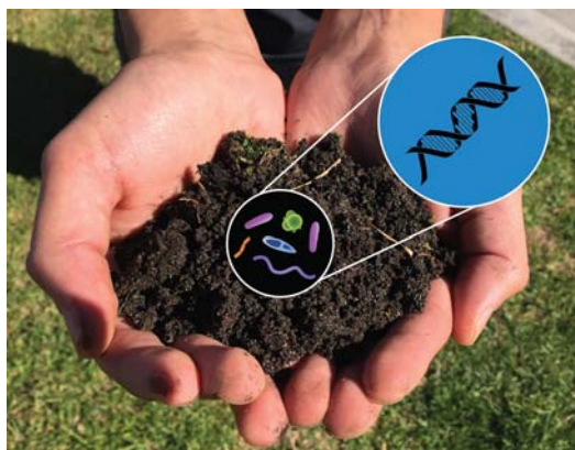
Figure 1. Unearthing biosynthetic diversity in soil-dwelling bacteria. Charlop-Powers et al. undertook a large-scale PCR and sequencing effort to identify and compare biosynthetic genes from bacterial communities in soil samples collected from around the world.

another. Very little overlap was observed between samples collected from different global locations (less than 3%), even if they were collected from similar biomes (that is, regions with similar climates and ecosystems).