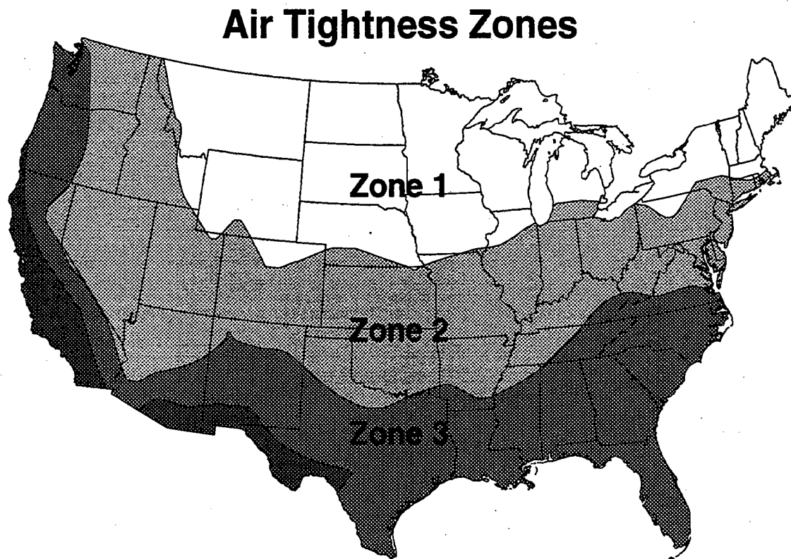
FIGURE 1. Air Tightness Levels. Each of the four zones represents an increasingly larger range of airtightness that would be meet both ASHRAE Standard 119 and ASHRAE Standard 62. Zone 1 buildings cannot meet both standards; Zone 2 and 3 buildings can. Zone 4 (not labeled) has a large acceptance range, but requires very leaky construction.

The issue of whether these standards are set at appropriate levels is a valid one, but the expressions presented above can be used to help understand the implications of a variety of standards and levels. The equations are at a degree of simplicity that rivals the rule of thumb in Equation 1, but contains significantly more usable information. It is interesting to note that with the correct interpretations Equation 2 and Equation 3 can be combined to yield that rule for certain circumstances.