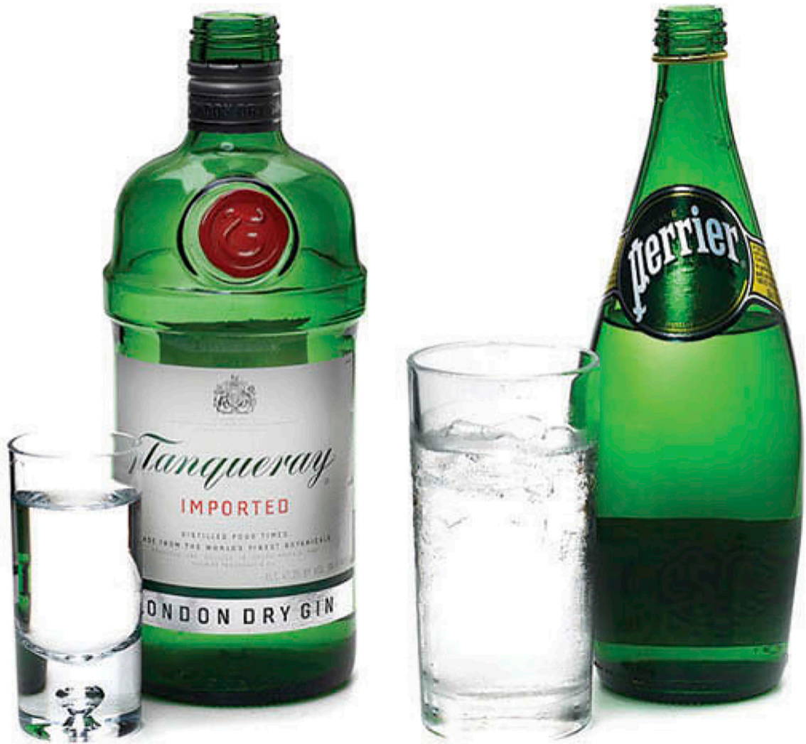
Figure 1. Example of matched alcohol (left, Tanqueray gin) and non-alcohol (right, Perrier mineral water) images from the American Alcohol Photo Stimuli (AAPS) set.