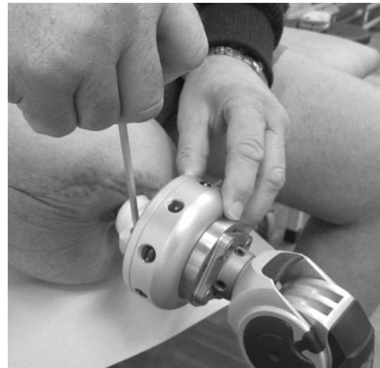
Fig. 3 A lateral view is shown of a patient securing an external prosthesis to the abutment.

Clinical observations have led us to believe that poor primary osseointegration increases the risk of subsequent