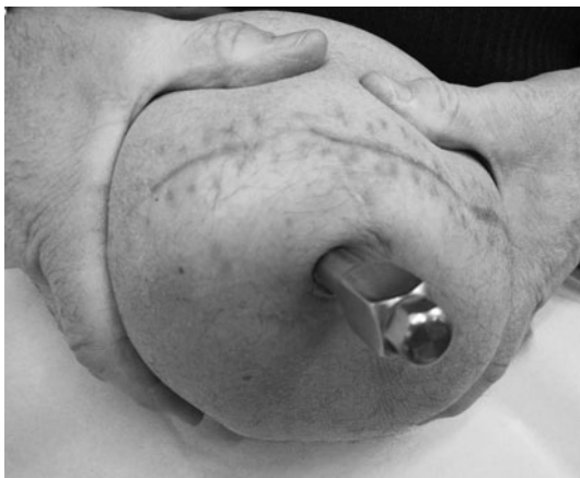
Fig. 2 This is a ventral view of the transcutaneous component (abutment) in a patient with a transfemoral amputation.

in clinical use in prosthetic teeth replacement since 1965 [4]. One report suggests a 15-year implant survival rate of approximately 90% in mandibular bone [1]. With osseointegration, direct contact between fixture and bone tissue is intended, assuring a stable, long-term attachment for the external prosthesis [5]. This technique results in easy prosthesis handling, improved limb control, and eliminates socket-impaired ROM and socket-caused skin disorders [15, 16, 30] (Fig. 2). During the years, various attempts to anchor prosthetic limbs with transcutaneous metal implants other than titanium [17, 18, 25] have failed, primarily owing to infection. Currently, our center has treated more than 100 patients with femoral titanium implants (Fig. 3), three with tibial implants, 15 with humeral implants, and 20 with ulnar and/or radial implants. Treatment failures were more common before we introduced a standardized treatment protocol in 1999 [14, 28].