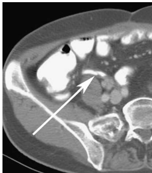
Fig. 2 Sixty-six-year-old man undergoing evaluation for hematuria. Contrast-enhanced transverse CT image shows a normal enteric contrast filled appendix (arrow) with outer wall-to-outer wall diameter of 7 mm. Acute appendicitis can be excluded on the basis of morphology, regardless of maximal diameter