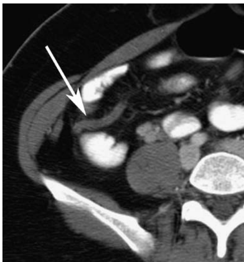
Fig. 3 Thirty-five-year-old woman undergoing evaluation for hematuria. Transverse CT image with intravenous and enteric contrast shows a normal appendix with a fluid-filled lumen ( arrow ). The outer wall-to-outer wall diameter measures 6 mm. The maximal depth of intraluminal fluid is 2 mm. Airless fluid filling the appendiceal lumen is rare in an asymptomatic patient and should prompt a clinical evaluation for appendicitis

sensitivity and specificity for the diagnosis [12–22]. In most cases, CT interpretation is straightforward with cases definitively falling into either positive or negative categories. When appendicitis is present, we typically find both appendiceal enlargement and secondary signs of inflammation. In normal cases, by contrast, the appendix may demonstrate a range of sizes, but no secondary signs of inflammation are usually identified. Unfortunately, as appendiceal enlargement is sometimes the only sign of appendicitis, up to 12% of cases may be equivocal at CT [4].