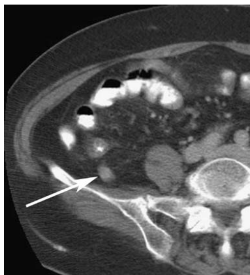
Fig. 4 Eighty-year-old woman undergoing evaluation for hematuria. Transverse CT image with intravenous and enteric contrast shows an isodense or collapsed appearing appendix in an asymptomatic patient measuring 1 cm in outer wall-to-outer wall diameter ( arrow ). A normal, but large, appendix with this morphology may be mistaken for early appendicitis at CT. In this case, it was queried on the radiologic report

Our study has several limitations. The primary limitation is the lack of a standard of reference for proof of a normal appendix. However, pathological correlation is unavailable in this population, as none of the patients included in our study had any clinical evidence of acute appendicitis or colonic disease. Furthermore, the outer wall-to-outer wall