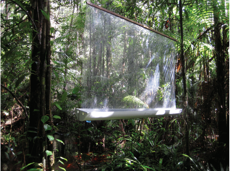
Figure 2. Picture of the modified windowpane trap described in this study (Lamarre G).