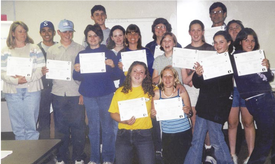
4-H teen teachers and adult volunteer leaders who completed the Animal Ambassadors training and implementation project in San Luis Obispo County display their diplomas.