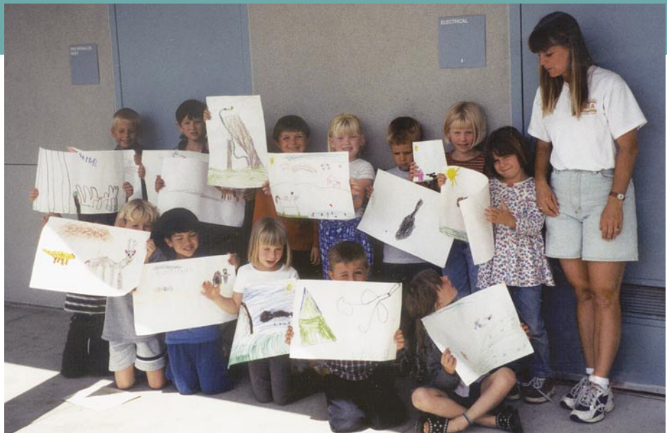
A program of the UC Davis Veterinary Medicine Extension, Animal Ambassadors seeks to stimulate interest in science through hands-on activities. Children from the San Luis Obispo County YMCA display their artwork from an Animal Ambassadors curriculum activity.