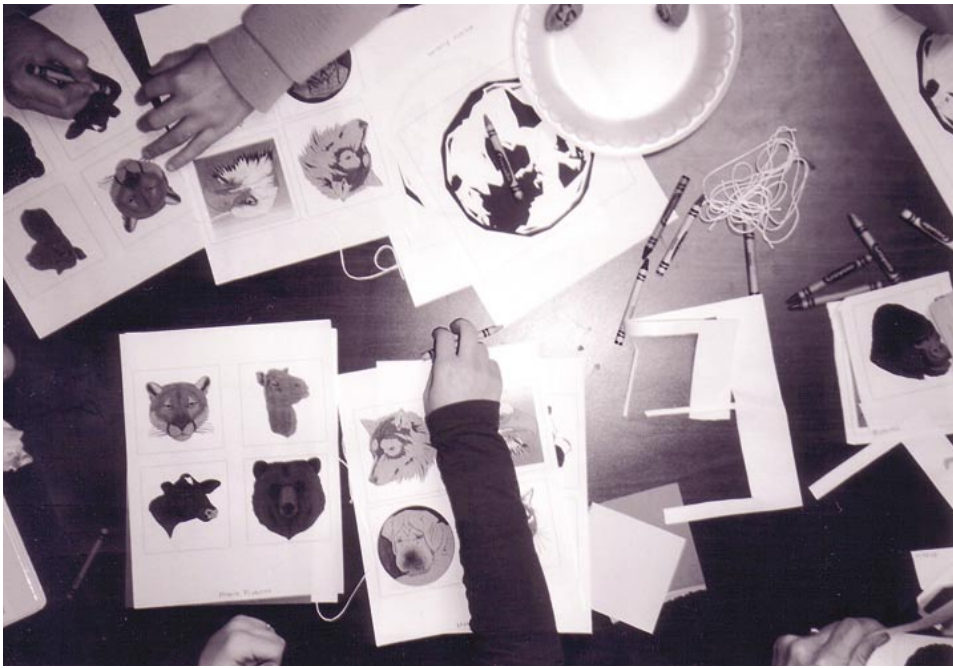
4-H teen teachers from San Luis Obispo County prepare to practice the “World of Art” activity during an Animal Ambassadors curriculum-training workshop.