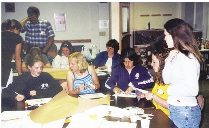
4-H teen teachers, adult volunteer leaders and 4-H county staff work in teams during an Animal Ambassadors curriculum-training workshop.