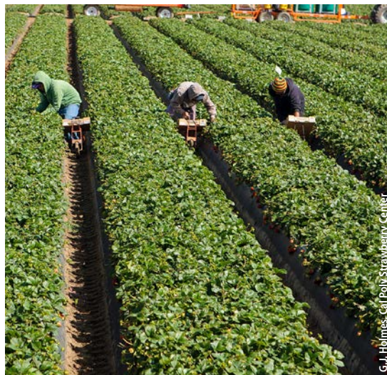
G.J. Holmes, Cal Poly Strawberry Center

A manual harvest crew picking strawberries for fresh market sale. While it is difficult to match the speed and accuracy of human harvesters, rising labor costs make robotic alternatives increasingly attractive.