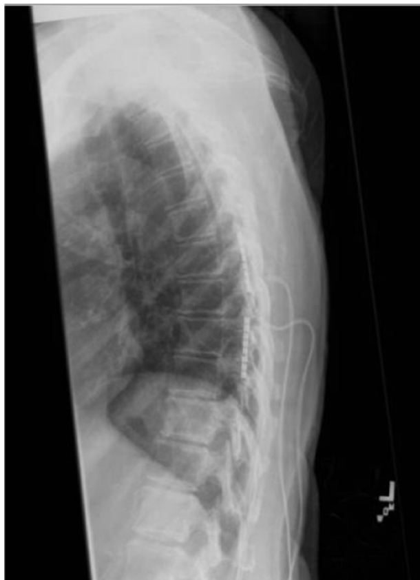
Figure 2 Lateral thoracic X-ray image showing permanent paddle lead placement in the thoracic interspaces.

Written informed consent was obtained from our patient for publication of this case report and any accompanying images. Institutional Review Board was not needed