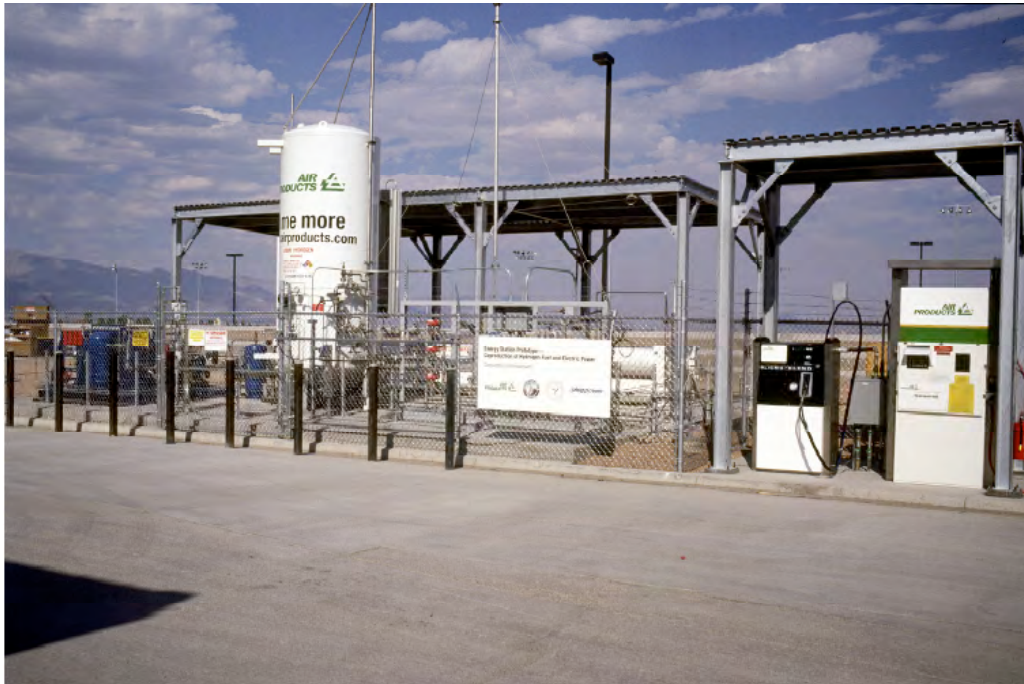
Figure 5: The Las Vegas hydrogen energy station.

The station has reportedly experienced problems with its fuel cell system, and it is at present using hydrogen that is being delivered from an industrial hydrogen production facility rather than produced onsite. Figure 5 presents a picture of the Las Vegas station.