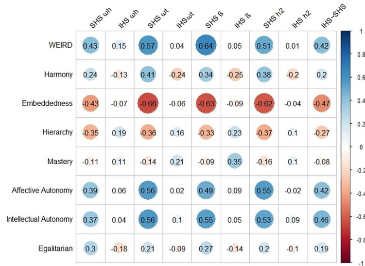
Fig 3. Country level correlations between subjective country level variables and happiness variable reliabilities. Note. IHS = Interdependent Happiness Scale, SHS = Subjective Happiness Scale, ωt = total common variance, ωh = general factor saturation, β = smallest split half reliability, h2 = average communality score. WEIRD scores originally from Muthukrishna et al. [37], values scores originally from Schwartz [38].

https://doi.org/10.1371/journal.pone.0242718.g003