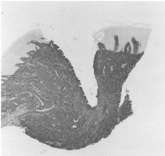
Fig. 2. Typical incision profile in oral soft tissue using a CO 2 laser at 3 W average power, 20 W peak power, 300 μs pulse duration and 1100 Hz. Incision is deep and narrow, and collateral damage is moderate

come and avoiding damage to adjacent structures. Moreover, a thick layer of thermal damage at the margins of a wound will tend to delay healing and weaken wound cohesive strength.