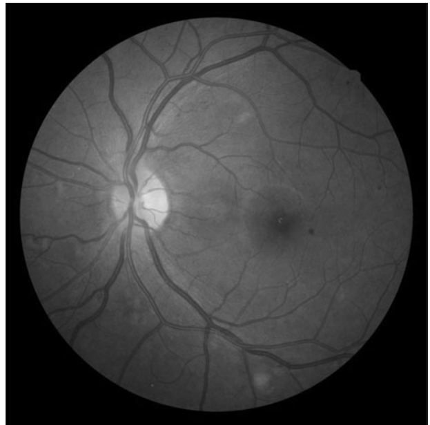
Fig. 2. Diabetic retinopathy diagnosed with a 45° fundus photograph of a diabetic patient screened at the family practice clinic at the University of California Davis Medical Center, using a Nidek AFC-210 nonmydriatic fundus camera with 10-megapixel resolution, remotely accessible via ANKA.

online electronic imaging database called ANKA (Fig. 2). All digital images, from both rural and urban settings, were reviewed by the same retinal specialist from the University of California Davis Eye Center (S.S.P.) using the same liquid crystal display monitor of 1280×800 resolution. The findings were documented electronically into EyePACS for rural sites and in the patient's electronic medical record for the urban center. The diagnosis of diabetic retinopathy was made by the presence of any signs of diabetic retinopathy including dot-blot hemorrhage, microaneurysms, cotton wool spots, exudates, and abnormal neovascularization. Other incidental fundus photograph findings, other than diabetic retinopathy, were also documented by the reviewer.