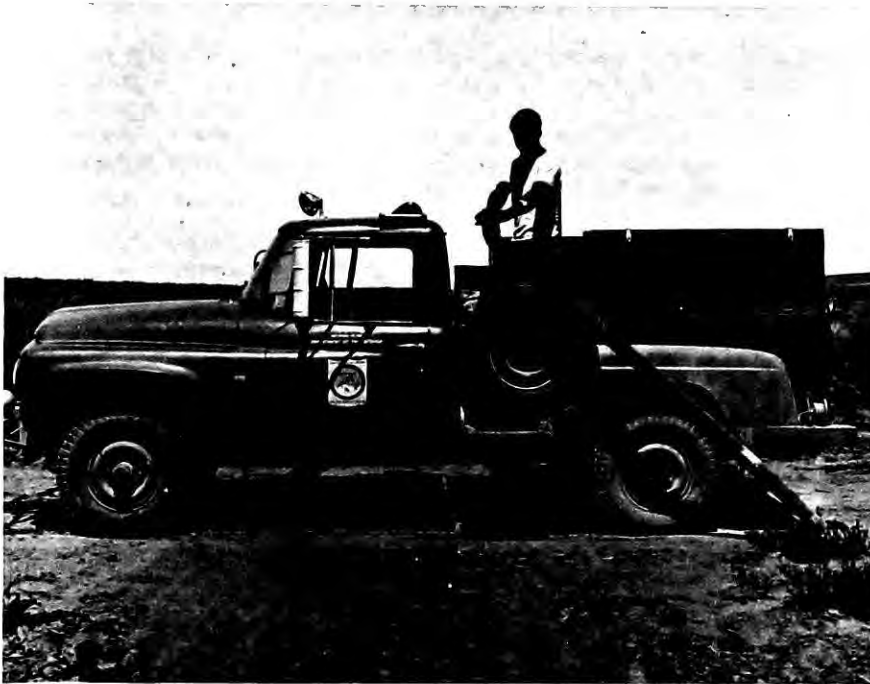
Fig. 3. In baiting operations, carrots are transferred from container to tube by operator. Baiting rate is regulated by speed of the vehicle.