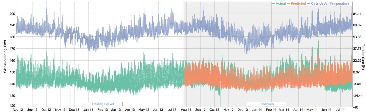
Figure 1. Actual and model-predicted energy data, overlaid with outside air temperature, for a 12-month training period and 12-month prediction period.

This testing procedure assesses model performance in general, ‘on average’ across populations of many buildings. Once it has been determined that a new model of interest performs well on a population basis , the practitioner can have reasonable confidence that the model is viable for use in M&V. The model can then be applied to specific buildings that have undergone, or will undergo an efficiency intervention. The principles of ASHRAE Guideline 14 (ASHRAE 2014) may be followed to determine whether the model fit is sufficient for each building in the program, and to quantify the uncertainty in the savings that are estimated. Savings and uncertainties for each building can be aggregated for a portfolio level analysis. This approach is described further in the Initial Results section.