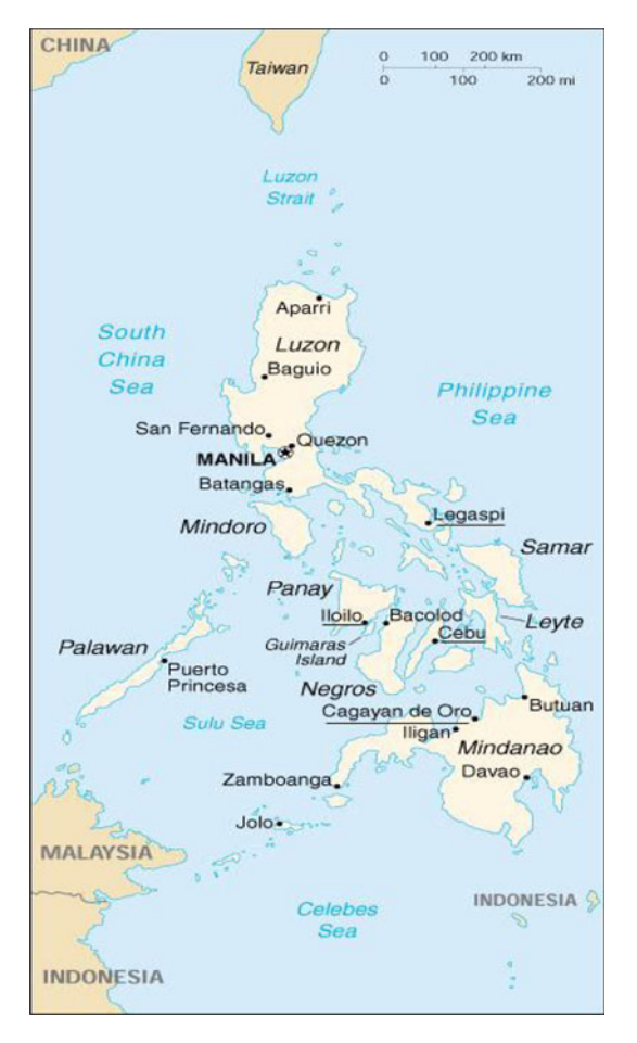
Fig. 1 Map of the Philippines showing the geographic location of the intervention sites (underlined cities)

All the variables were initially analyzed descriptively by univariate statistics, including examining frequencies, percentages, means and standard deviations. The data were examined for the presence of missing values, influential outliers, skewness and kurtosis for key continuous predictor variables. Missing information was imputed using multivariate imputation by chained equation method [34].