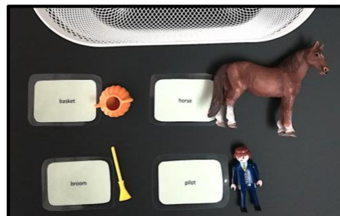
Figure 1: Example of an object set.

Participants passed 93% of the sanity checks, demonstrating that performing the task was easy and that interest did not drop over the course of the trials.