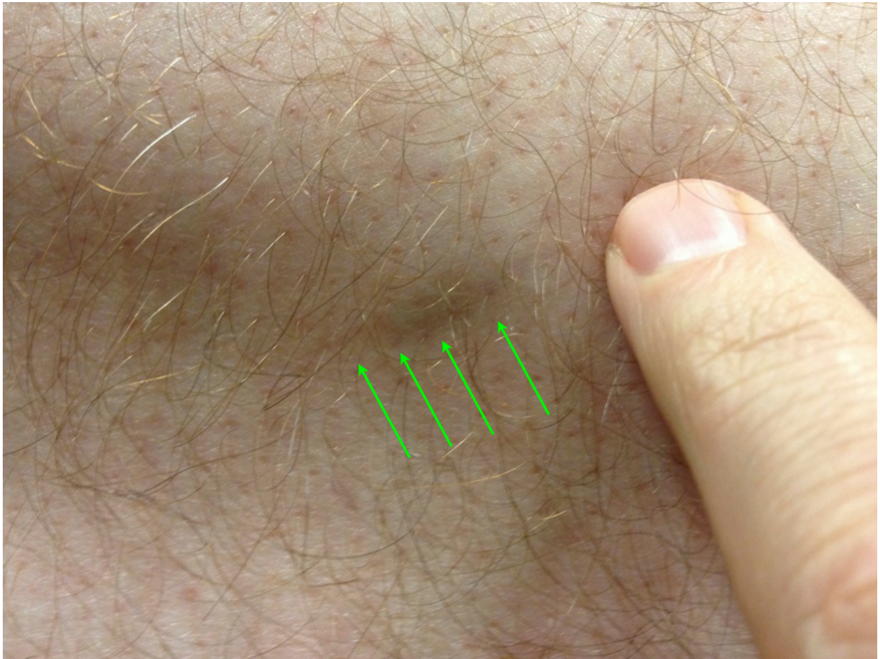
Figure 1. Sewing needle palpable below the skin