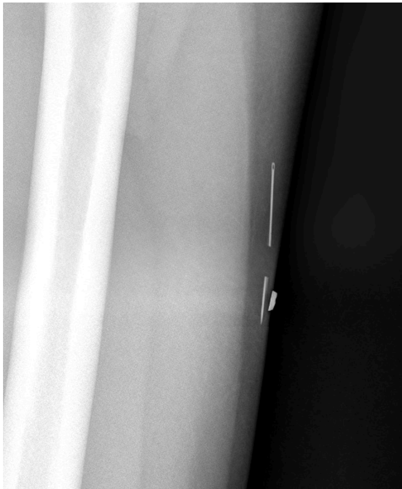
Figure 2. Lateral radiograph of the left thigh. Lead marker over skin where the foreign body was detected by palpation