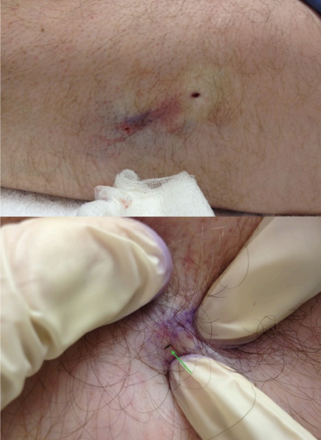
Figure 3. Exposure of the fractured needle through the skin during surgical removal

Under local anesthesia, a small linear partial thickness skin incision was made and the two segments of the sewing needle were extracted with a needle driver ( Figure 3 ). The specimen was submitted for histopathologic examination, which confirmed two fragments of a needle ( Figure 4 ).