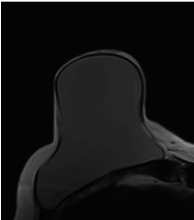
Fig. 3. Postoperative MRI of implant reconstruction complicated by major mastectomy flap necrosis with minimal subcutaneous tissue present in the majority of thin mastectomy flaps.

larly if areas of potential ischemia will be overlying these materials. In such cases, we will often consider conversion to a total submuscular approach utilizing serratus fascia to protect the underlying prosthesis. In cases with significant concern for skin envelope ischemia intraoperatively, delaying the reconstruction can be considered in both prepectoral and subpectoral reconstructions to allow for adequate perfusion of the skin envelope before prosthesis placement. 41 Adjunctive postoperative therapies, such as the use of nitroglycerin ointment, may also be utilized if there is concern for ischemia intraoperatively. 42 Other interventions, such as nipple delay, can be useful in patients that are determined to be high risk preoperatively. 43,44