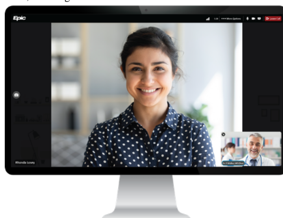
Figure 1. Representative illustration of the interface used for pain telemedicine visits at the UCLA Comprehensive Pain Center (© 2021 Epic Systems Corporation). UCLA: University of California, Los Angeles.

Figure 1 illustrates the video interface for the telemedicine visits.