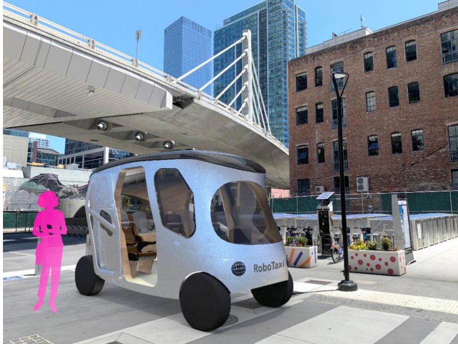
Fig. 1. Electric, shared, and automated RoboTaxi concept with flexible seating and separation screen guards.