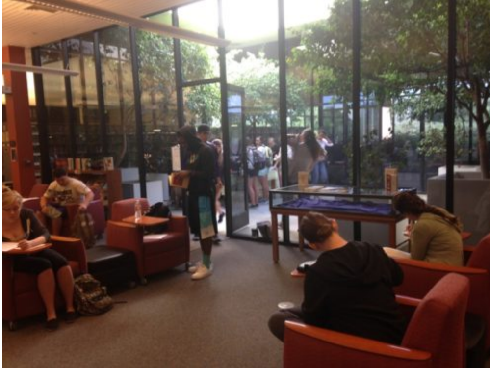
Students writing poetry inside and outside the atrium, our "Idea Box" of sorts at Pearson Library