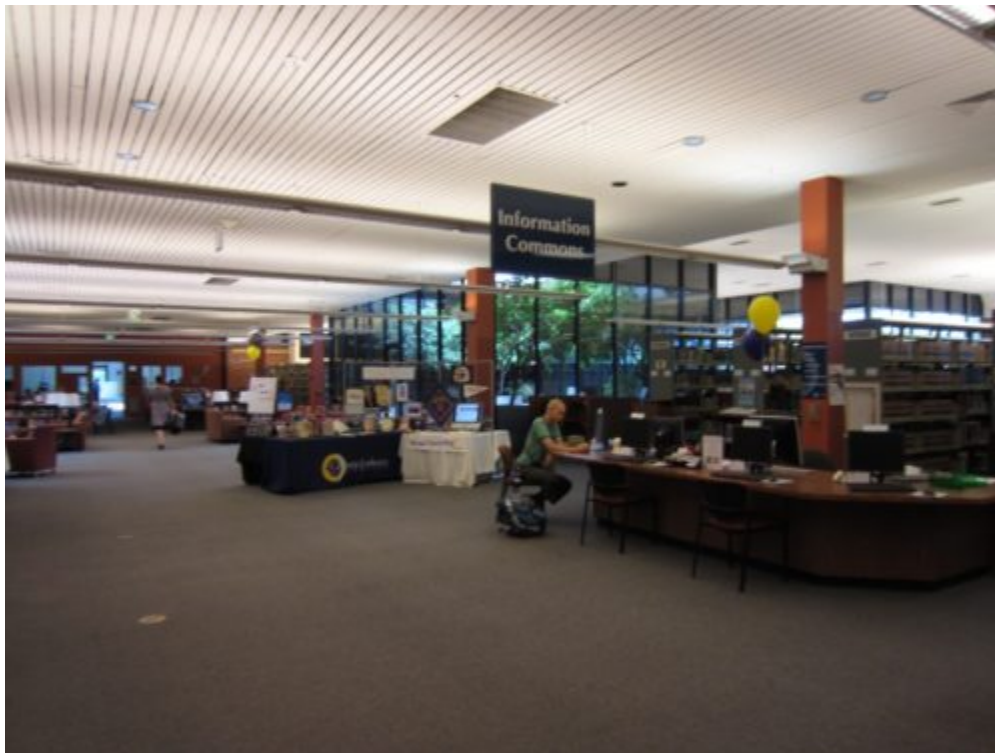
Information Commons Desk with directional sign above