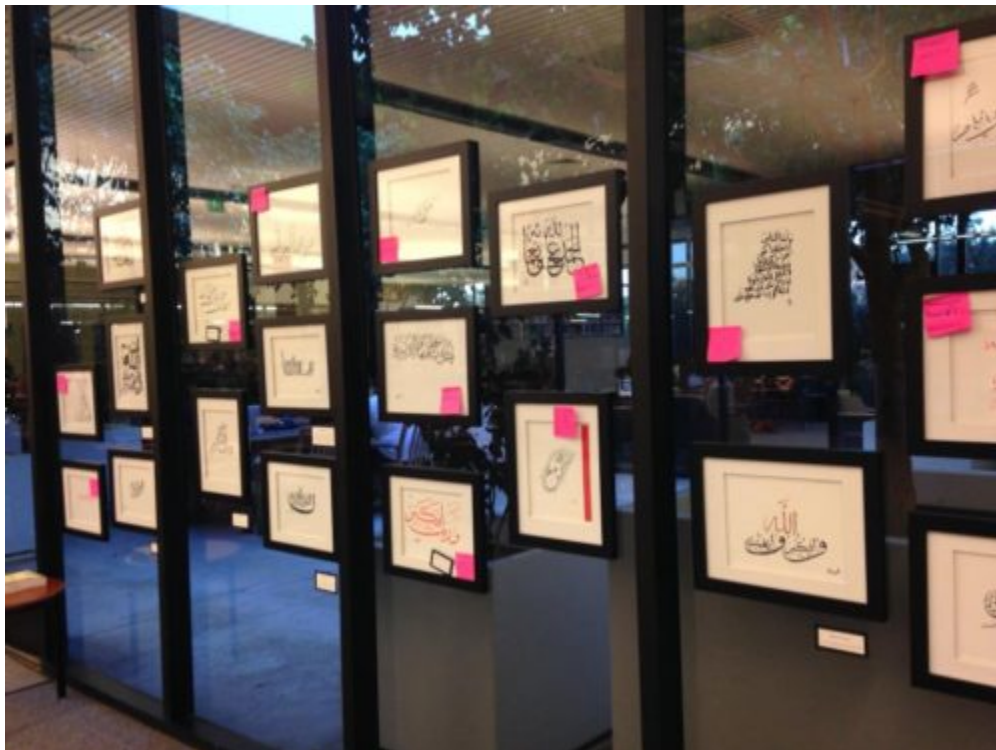
Hanging the Islamic Calligraphy Show on the atrium windows in 2014

Now for the reality check. During the 2014-2015 academic year, we were not able to realize the physical transformation of the space through renovation, though library administration approved of the ideas and design consultants were brought in. The money just wasn't available that year. But we ran a series of successful programs that demonstrated the potential of the beta reference space and generated new energy around reference services as the central arm for outreach and research support (as opposed to access services or information literacy instruction). In our first event, the atrium windows were used for the first time as gallery space for a student exhibition of Islamic Calligraphy and a small reception was held adjacent to the IC Desk in December 2014. Students and faculty came to speak about their work learning a new language and artistic technique through experiential learning in this calligraphy course.