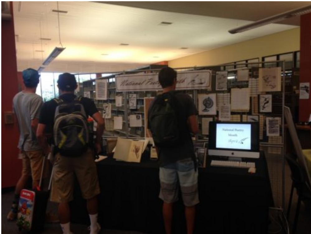
Adding new work to the April National Poetry Month display