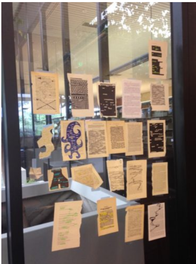
Students began to add their work to the atrium windows after writing poetry in a class session held in the atrium