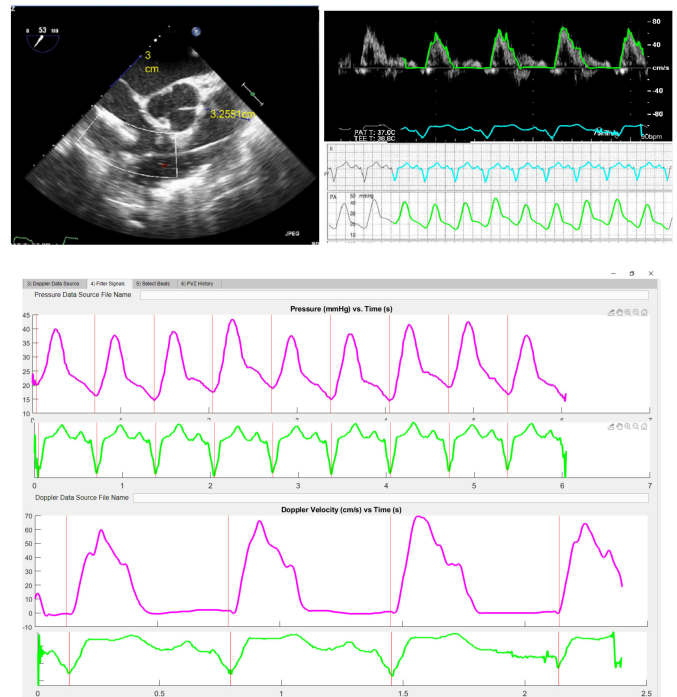
Figure 1. (Top left) Parasternal short axis view of the main pulmonary artery (PA). PA diameter is measured at the pulmonic valve. (Top Right) automated tracing of pulsed-wave Doppler velocity in the proximal PA and PA pressures along with ECG for timing. (Bottom) Individual beats for both pressure and Doppler velocity are identified using ECG signals from each capture.

Digital Object Identifier 10.1109/OJEMB.2021.3076726