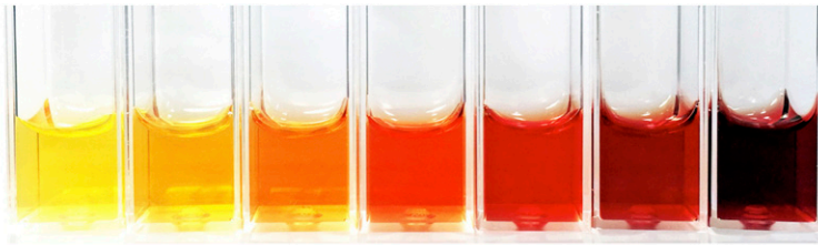
FIGURE 3 Methods to determine hemolysis levels in plasma or serum. A representation of plasma or serum within increasing levels of hemolysis is shown. Below the images are the corresponding Hb concentrations (means \pm SDs; n = 3 ) and approximate RGB color model values of the corresponding plasma or serum. The iron values listed for the lowest category of hemolysis reflect the clinical reference range in nonhemolyzed plasma or serum (0.5–1.8 mg/L) (20). A_{540\text{nm}} , absorbance at 540 nm; Hb, hemoglobin; RGB, red, green, blue; <DL, below the detection limit of 0.05 absorbance.