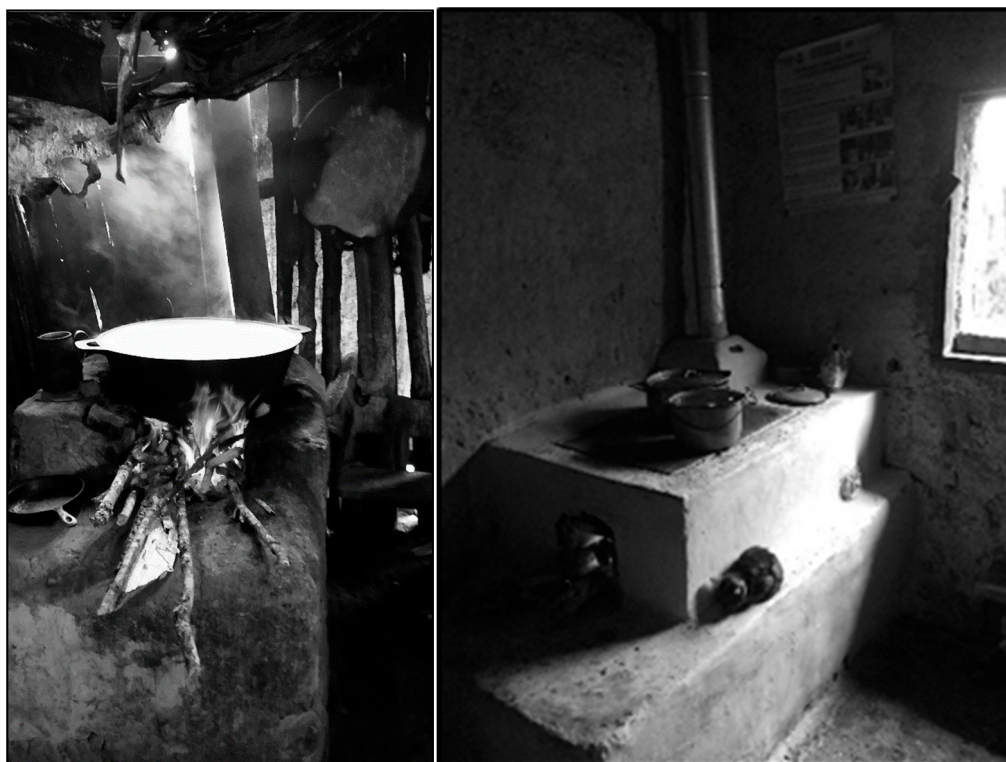
Figure 1. Typical traditional (left) and Justa (right) cookstoves in the homes of Honduran women.

The cleaner-burning Justa stove is a common wood-burning cleaner-burning stove in Latin America with a rocket-elbow combustion chamber, chimney, and metal griddle suited to making tortillas.