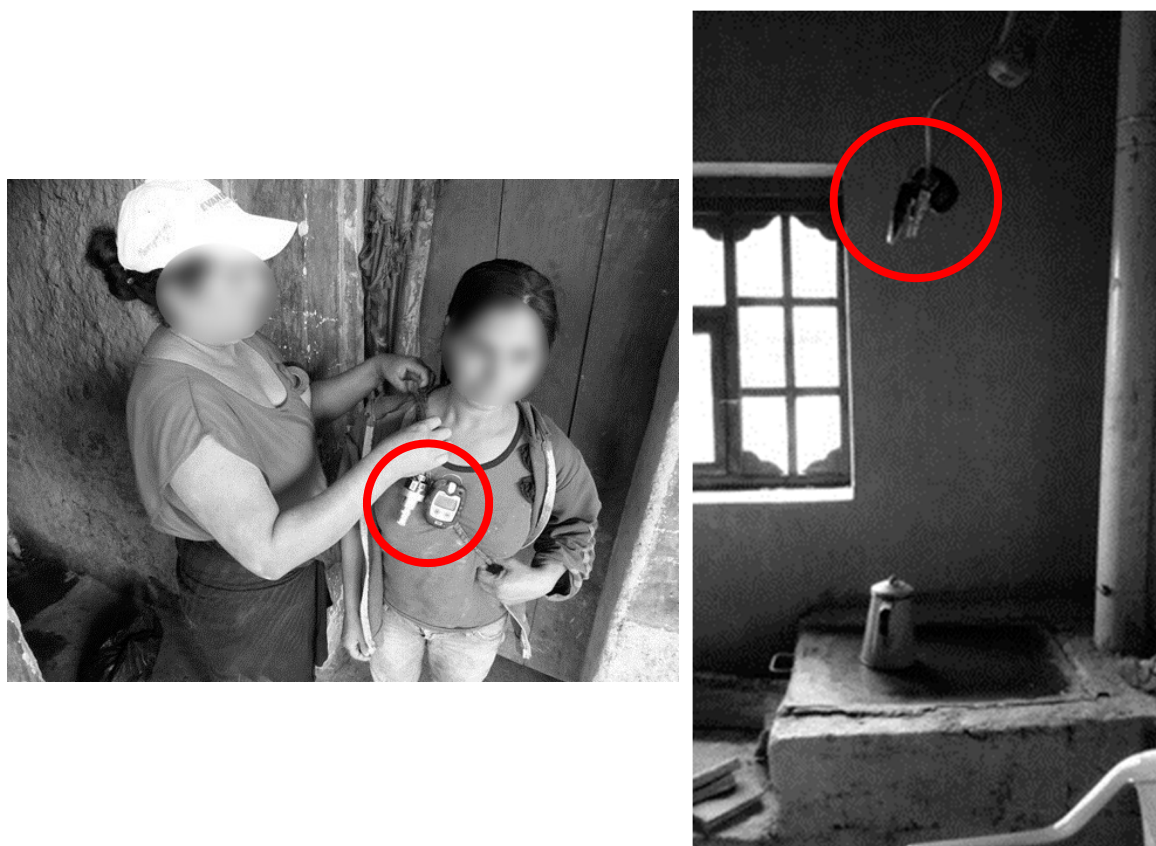
Figure 2. Example placement for kitchen exposure measurements (left) and personal measurements (right).