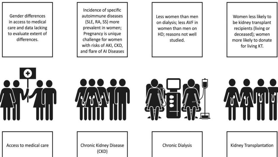
Fig. 1. Sex differences throughout the continuum of CKD care. SLE: systemic lupus erythematosus; RA: rheumatoid arthritis; SS: systemic scleroderma; AKI: acute kidney injury; CKD: chronic kidney disease; AI: autoimmune; AVF: arteriovenous fistula; HD: hemodialysis; KT: kidney transplant

Girls and women, who make up approximately 50% of the world's population, are important contributors to society and their families. Besides childbearing, women are essential in childbearing and contribute to sustaining family and community health. Women in the 21st century continue to strive for equity in business, commerce, and professional endeavors, while recognizing that in many situations, equity does not exist. In various locations around the world, access to education and medical care is not equitable among men and women; women remain underrepresented in many clinical research studies, thus limiting the evidence base on which to make recommendations to ensure best outcomes (Fig. 1).