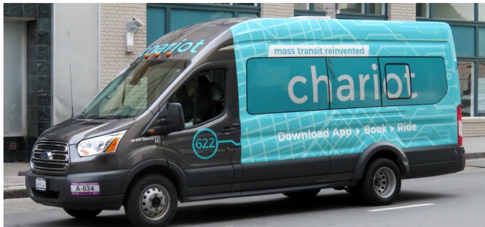
Figure 4.2. Chariot Microtransit Van.

SFMTA requires microtransit and shuttle providers to apply for a PTV permit. With this permit, the SFMTA ensures that stops are located at designated passenger loading zones. The operator is required to share GPS and ridership data with the agency and pay an annual permit fee to cover administrative and enforcement costs. Chariot was the first microtransit service to receive a PTV permit and the agency assisted Chariot in relocating over 100 stops throughout the permitting process (SFMTA, 2017). Chariot was acquired by Ford Motor Company in September 2016. However, Chariot announced the end of its microtransit operations, and the service ended in March 2019.