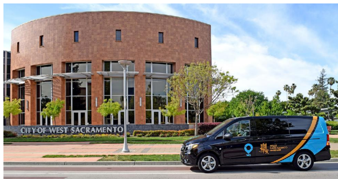
Figure 4.1. A Via Van in West Sacramento.

The city of West Sacramento released an update on the program after nine months of operation. As of February 2019, over 50,000 rides had been completed. Normalizing over nine months, the service cost the city around $11 per ride. In comparison, the Sacramento Regional Transit estimates that it spends $8.11 per passenger ride for bus service (SACRT, 2019). Ridership averaged around 350 rides per day on weekdays and 250 rides on Saturdays. These findings are almost double the original estimates projected for average daily ridership. Similarly, over 60% of the rides were pooled (i.e., two or more passengers). The City Council is considering a contract renewal for another year (City of West Sacramento, 2019a and 2019b).