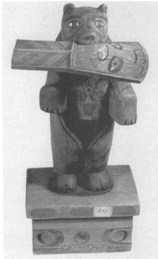
FIGURE 3. Curio by Frederick Alexie (Vancouver Museum).

These issues of land and its ownership, settlement, and use are of course at the heart of the relationship between Native and non-Native peoples in