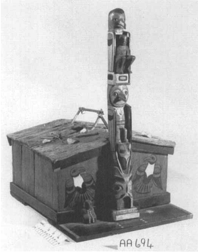
FIGURE 5. Model house by Frederick Alexie (Vancouver Museum).

personages set against the land, the old plank houses set in a wider landscape (see fig. 5), aerial views of the village, pole-raising and potlatch preparations, the meeting of two chiefs, and the use of eagle down to greet ceremonial guests are all part of a linked cultural continuum kept alive and re-celebrated in Alexie's paintings. Like the gravestones, and perhaps like Alexie's carvings, the adaptation of the new did not signify an absolute rejection of the old, just as participation in the Euro-Canadian systems—economic, religious, artistic, or otherwise—did not preclude the continuing assertion of aboriginal rights, particularly in terms of access to land and maritime resources.