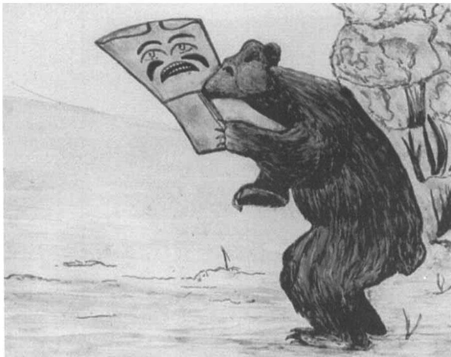
FIGURE 4. Lantern slide painting by Frederick Alexie (Vancouver Museum).

Canada. For this reason, I suggest that the significance of recording the land should not be interpreted as a universal response to its sense of the picturesque. In other words, the meaning of what Alexie was depicting changes according to the audience viewing it. Most of his paintings are concerned with historical subjects: the landscape around Port Simpson, the community's first horse, the meeting of chiefs, an indigenous attack on the early Hudson's Bay trading post, a crest-like image of a bear biting a copper (see figs. 3 and 4).