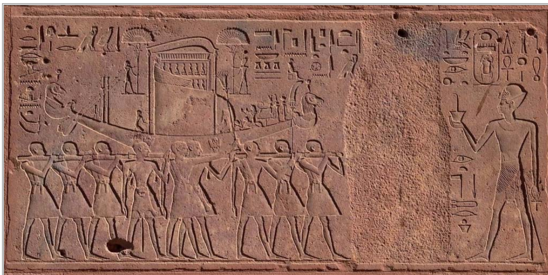
Figure 4. Hatshepsut (now hacked out) welcoming the procession, and Thutmosis III censing before the processional bark of Amun carried by priests (Red Chapel).