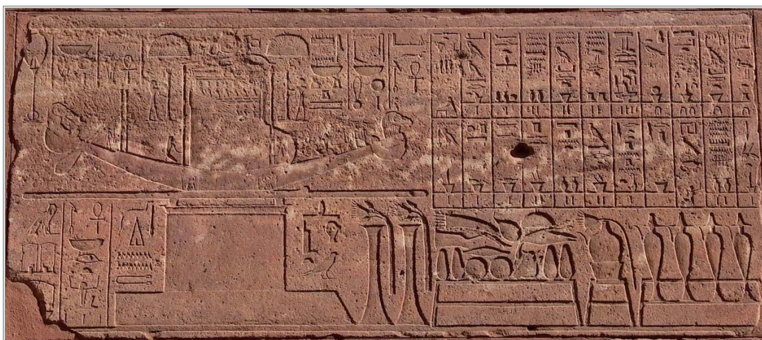
Figure 5. Offerings consecrated to Amun in his processional bark (Red Chapel).

In the Theban festival of Opet, Amun came forth from his temple in Karnak and went southward to the Luxor Temple, where he received offerings, was recharged with energy thereby, and confirmed the sovereigns' kingship in return. It has also been speculated that the feast may have celebrated a hieros gamos , as suggested by the prominent role played by the "God's Wife," a high-ranking priestess. In the Opet Festival processions Amun either traveled overland or sailed on the river parallel to the bank, apparently depending on the personal preference of the