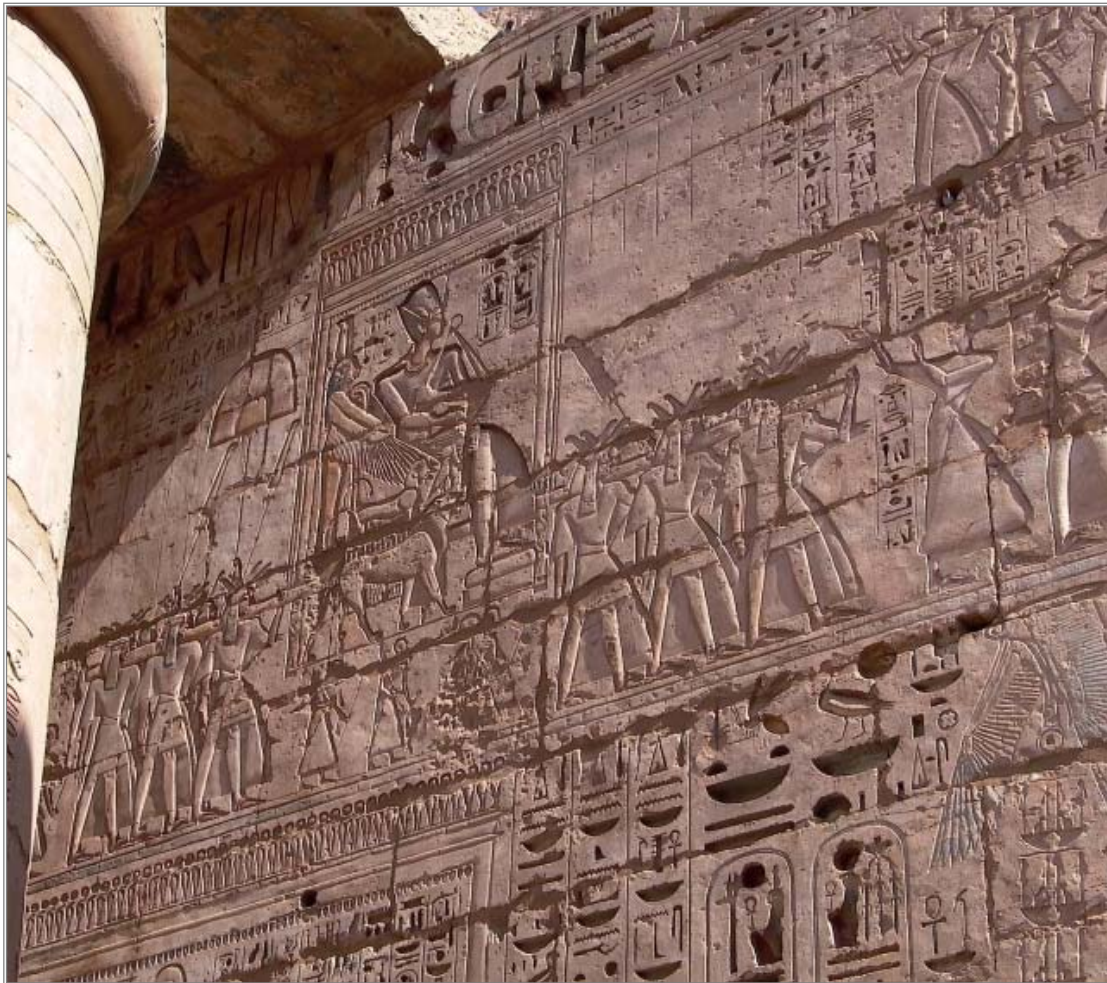
Figure 1. Ramesses III leaving the palace in a palanquin carried by princes and officials during the festival of Min (Great Temple of Ramesses III, Medinet Habu, second court).

processional routes in that period. In fact, the bulk of source material dates to the New Kingdom and particularly to the Ptolemaic Period. This bias in the chronological distribution of the surviving material has, consequently, a bearing on the relative validity of our interpretations and reconstructions. Despite this caution, we may surmise that the basic features of processions were similar before, during, and after the New Kingdom. The so-called Khoiak Festival at Abydos may stand as evidence. For the Middle Kingdom, the procession of the underworld god Osiris during the Khoiak Festival is well documented. The procession can be reconstructed as follows: It left the god's temple at Abydos to visit his desert burial