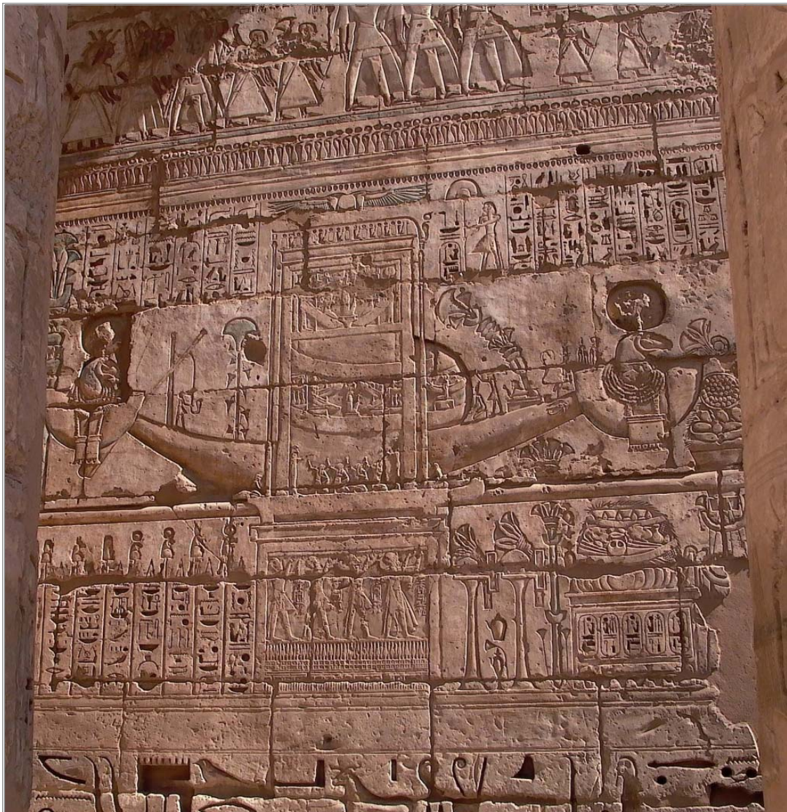
Figure 2. The processional bark of Amun Userhat (Great Temple of Ramesses III, Medinet Habu, second court).