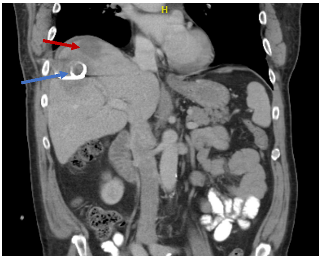
FIGURE 2 CT abdomen and pelvis with contrast from the patient's fifth episode of recurrent liver abscess. This shows a large abscess (red arrow) within the liver dome, measuring 8.2 cm. There is a heterogeneous abnormal signal within the right hepatic lobe inferior to the liver dome abscess, corresponding to the previously drained abscess cavity; the percutaneous drainage catheter is noted within this region (blue arrow).

We describe a case of recurrent ALA in a patient previously treated with metronidazole without repeated travel to an endemic area. Despite treatment with a 10-day course of metronidazole 4 years ago for ALA, the patient developed three additional episodes of liver abscesses, ultimately found to be from amebiasis. This case highlights the importance of using appropriately dosed metronidazole,