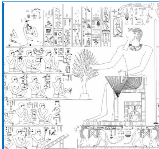
Figure 2. A recently discovered scene from the causeway of Sahura: the king in the company of his sons, mother, and wife.