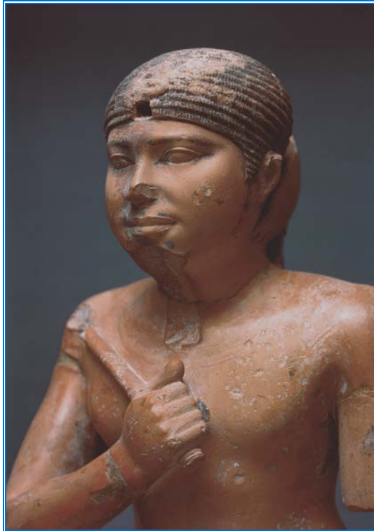
Figure 3. Statue of king Raneferef.

Kriéger 1976; Posener-Kriéger, Verner, and Vymazalová 2006).