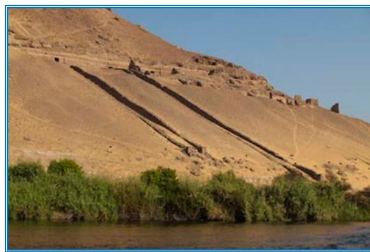
Figure 8. Provincial cemetery of wealthy officials of the Sixth Dynasty, Qubbet el-Hawa, Aswan.

between Pepy II and Merenra cannot be excluded. Pepy II became the ruler whom Egyptologists traditionally associate with the official end of the Old Kingdom and the Sixth Dynasty, around 2150 BCE. A short inscription found on the island of Elephantine indicates, through its mention of the second anniversary of his sed festival (Sethe 1933: Urk. I: 115), that his rule was a lengthy one of at least 60 years. There are claims that he ruled for up to 90 years, but the figure of 60 years would certainly seem more realistic (Hornung, Krauss, and Warburton 2006).