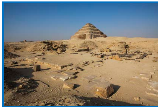
Figure 1. Mortuary complex of Userkaf, located at the northeast corner of Djoser’s precinct, Saqqara.

Ghurab he innovated a new type of construction, the sun temple, which came to an end in the reign of Djedkara. Userkaf’s Horus name, meaning “He who has established order,” prompts us to surmise that he acceded to the throne under uneasy circumstances and sought symbolic support from the venerated pharaoh Sneferu, whose Horus name read “Lord of Maat.” Indeed Userkaf’s reign saw major changes—in the concept of the administration, in the economy, in religion, and in the royal funerary complexes—that altered the character of the period (Bárta 2005 and 2016a).