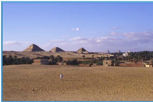
Figure 6. Pyramid necropolis of the Fifth Dynasty, Abusir.