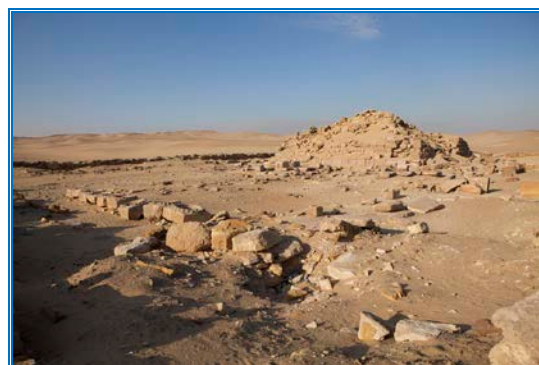
Figure 4. The sun temple of Niuserra, Abu Ghurab.

The reign of Raneferef's brother, Niuserra, marked a major change in aspects of both the society and state. Niuserra's reign was one of the longest of the Fifth Dynasty and lasted perhaps more than thirty years, as scenes from the sed -feast in his sun temple at Abu Ghurab indicate (fig. 4). The vizier Ptahshepes, a contemporary of the king, built for himself at Abusir a unique tomb complex (fig. 5), adopting architectural elements that had heretofore been exclusively royal (Krejčí 2010). Similarly, his sons attained high official positions, though not the vizierate, in their own right. It is from this point that one perceives the growing influence of the hereditary principle in the country's administration. In the tombs of several officials of Niuserra's reign we find the first attestations of the cult of Osiris. As a consequence of the tendencies toward increasing independence in the provinces, Niuserra created the office of "Overseer of Upper Egypt," whose primary role was to control the country south of Memphis. The king's activities are attested from Byblos, Sinai, and the Eastern Desert, and he probably also fought Libyan tribes (Sowada 2009).