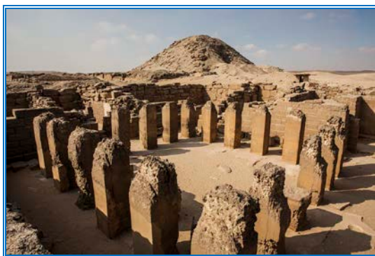
Figure 5. Monumental pillared court of the mastaba of Ptahshepses, Abusir.

tombs were now being built and lavishly decorated. Moreover, new motifs appeared in tomb decoration, including market scenes and representations of the desert, the latter possibly an indicator of changing environmental conditions. The available proxy data of the period—e.g., beetles found at Abusir; the long-term drop in Nile flood levels recorded on the Palermo Stone; settlement drift on the island of Elephantine; and recent paleoclimatic studies of climate fluctuations in northeast Africa and of the hydrogeological regime of the Nile River—all suggest that a major climatic deterioration took place around 2200 BCE, known as one of the Holocene Bond events (Bell 1971; Bond, Showers, and Cheseby et al. 1997; Bárta 2015b; Bárta and Dulíková 2015; and see Dalfes, Kukla, and Weiss 1997 on climate depredation attested outside of Egypt, as well, around 4.2 kiloyears BPE).