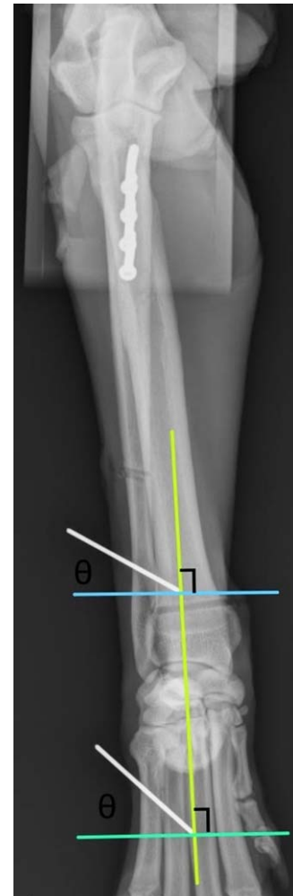
FIGURE 4 Craniocaudal radiograph of a pre-ulnectomy loaded specimen during testing without varus or valgus stress applied (neutral view). The relative rotation of the K-wires in the radius and in the metacarpal around the limb axis were used to calculate the carpal rotation induced during the stress radiographs

Following ulnectomy, the support and limb were reattached to the jig in the same position by replacing the screws connecting the support to the jig. This technique maintained the limb position on the jig before and after ulnectomy