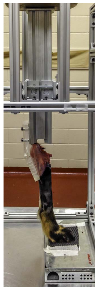
FIGURE 1 Picture of a cadaveric forelimb loaded at 30% of the dog's body weight. The 20^{\circ} acrylic supports can be seen connecting the testing jig to the caudal ulna. The angled support was chosen to follow the natural orientation of the caudal aspect of the ulna and allow for near-vertical loading of the limb

The cadaveric limbs were palpated for evidence of deformity or other abnormalities by one of the author (PA) and were disarticulated at the level of the scapula. The limbs were fresh frozen at -21^{\circ}\text{C} and thawed in a water bath at room temperature approximately 8 hours prior to the testing. Orthogonal radiographs of the radius and ulna that included the elbow and carpus were acquired. The soft tissues were transected circumferentially just proximal to the humeral epicondyles and the humerus was osteotomized using an oscillating saw. An approach to the caudal aspect of the proximal ulna was performed. 7 The antebrachial fascia was incised. The flexor carpi ulnaris was partially elevated to expose the caudal aspect of the proximal ulna. The limb was temporarily secured to a custom-made 20^{\circ} angled acrylic support using a linear external skeletal fixator (IMEX Veterinary, Longview, Texas). The purpose of the external fixator was to allow repositioning of the limb relative to the acrylic support until a true radiographic craniocaudal (CC) of the carpus was acquired. A 20^{\circ} angled acrylic support was chosen to follow