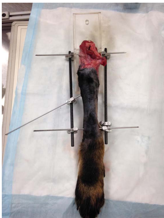
FIGURE 2 Picture of a cadaveric forelimb during initial set up. The limb was temporarily secured to a custom-made 20° angled acrylic support using a linear external skeletal fixator (IMEX Veterinary, Longview, Texas). The fixator was secured to the acrylic support using a 3-mm pin placed through a premade hole in the acrylic support. The purpose of the external fixator was to allow repositioning of the limb relative to the acrylic support until a true radiographic CC of the carpus was acquired. The fixator was removed before testing

plane limb alignment on radiographs. 8 In our study, the limb was loaded through the acrylic support and not the humerus, therefore, we modified the measurement technique, using the axis of the acrylic support in lieu of the humeral axis described by Goodrich et al. 8 The acrylic support was then secured to the caudal aspect of the proximal portion of the ulna using four 3.5-mm cortical screws. The external fixator was removed. Radiographs were made to ensure the screws did not penetrate the radius to avoid a potential interference with pronation and supination. The specimen and acrylic support were connected to a weight-bearing jig using 2 screws and washers (Figure 1). The custom-made testing jig was made of T-slotted aluminum tubing (80/20, Columbia City, Indiana). The jig stabilized the limb and allowed weights to be placed on top of it, simulating weight bearing. The manus was placed on a slip-resistant mat. The limb was loaded to 30% of the dog's body weight. The weight calculation accounted for the weight of the apparatus (1.2 kg).