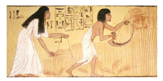
Figure 4. The married couple were expected to continue their conjugal life also in the hereafter. Detail of a wall painting in the tomb of Sennedjem (TT 1).

Descriptions of the ideal marriage process in the didactic literature agree partly with references to marrying found in other types of written sources from the Old Kingdom onward. The increase in the number of non-literary texts corresponds with a greater amount of more specific references to various aspects of marital life. The New Kingdom Deir el-Medina source material (Demarée et al. 2007) constitutes, for example, one notable corpus where such data are found (fig. 4). The abundant material from the Late Period (664 - 332 BCE) onward that, in addition to all sorts of informal texts, also comprises standardized deeds such as marriage contracts (fig. 5) offer