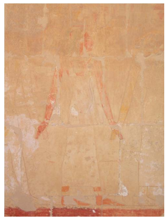
Figure 3. Despite the fact that children played a central part in the lives of ancient Egyptians, pregnant women are seldom depicted. One of the few examples depicts queen Ahmose in the Deir el-Bahri divine birth sequence.

Various types of written source material multiply from the Middle Kingdom (2040 - 1640 BCE) onward as literacy and access to written culture increase, yet references with specific information on the marriage process and divorce remain sparse (Jasnow 2003b: 274 - 275). Didactic literature, situated in the circle of the elite, contains some references to male ideals of marriage and family (Johnson 2003: 149 - 151; Lesko 1998: 163 - 171; Toivari-Viitala 2001: 51 - 55). In the Teaching of