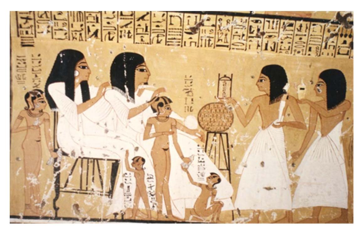
Figure 9. Children were expected to uphold the funerary cult of their parents. Detail of a wall painting from the tomb of Anherkhawy (TT 359).