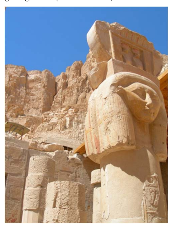
Figure 7. People could turn to the goddess Hathor at Deir el-Bahri and ask her to provide a wife.