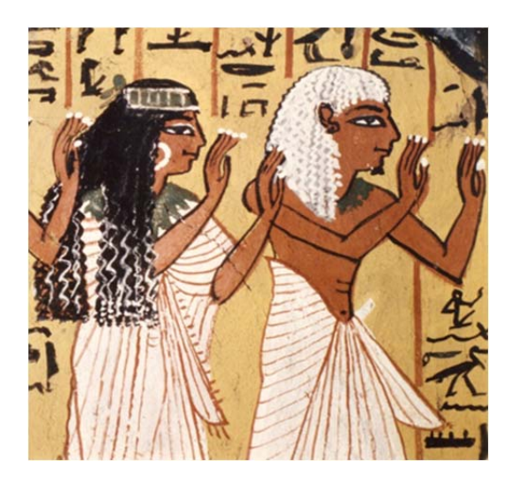
Figure 10. The parents of the spouses could play an important role in the life of the married couple also in the hereafter. Detail of a wall painting from the tomb of Pashed (TT 3).

might alternatively move in with the parents of either party (Allam 1977: 1167; Toivari-Viitala 2001: 86 - 87). In addition to being a spatially visible construct and marking social