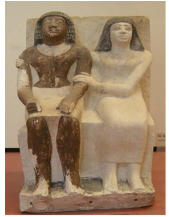
Figure 2. Husband and wife could be depicted on the same scale both in two-dimensional and threedimensional art. Limestone statue. Old Kingdom.

husband hay. Monuments with this kind of data continue to constitute a notable source of information through Pharaonic history. References to wives outnumber those to husbands. This is to be expected as persons mentioned in tombs were identified through their relationship to the tomb owner, who in most cases was a man. Marking the marital state does not appear to overshadow other titles designating high social rank and functions. References to actual marriages or marrying dating to the Old Kingdom are few (Jasnow 2003a: 119).