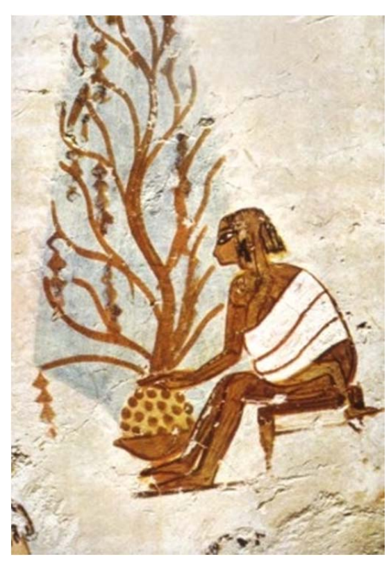
Figure 8. Even if the father was granted custody of the children when a couple divorced, the woman kept her status of mother of the children. Detail of a wall painting from the tomb of Menna (TT 69).

free of complications for the women, however. In the Late Period temple oaths, exhusbands are made to swear that they will leave their ex-wives in peace (Kaplony-Heckel 1963). Thus, cases where jealous ex-husbands harassed their former wives probably existed.