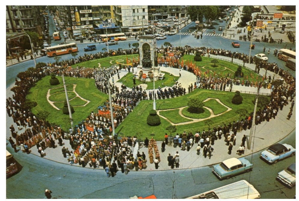
Figure 2 Taksim Square, Republic Monument 1970s.

as a "question of survival" for the country.<sup>11</sup> They rely on a very common tactic, using fear of an external or internal threat to create a support system in public, to legitimize their financial decisions. Language or discourse is the primary tool of legitimization. Like the signifier-signified relationship of the image, the relationship between what is said and concealed in discourse is as effective as the perception of the group. While explaining the areas of power struggle, Bourdieu talks about the "field" (champ) metaphor as structuring structure (education, religion, art, state, politic parties, unions, etc. are all fields, in which a dominant capital controls the order and rules of the field's operation to maintain its validity and clout), where a type of capital is distinctively imposed. Sites are, on the one hand, arenas, where products, services, information, or status are produced, put into circulation, and appropriated. On the other hand, they are real places of competition, which actors occupy in their struggle to accumulate and monopolize these different types of capital.<sup>12</sup> The present essay looks at Taksim Square, where prior conflicts turned various resources into capital to construct social power relations.