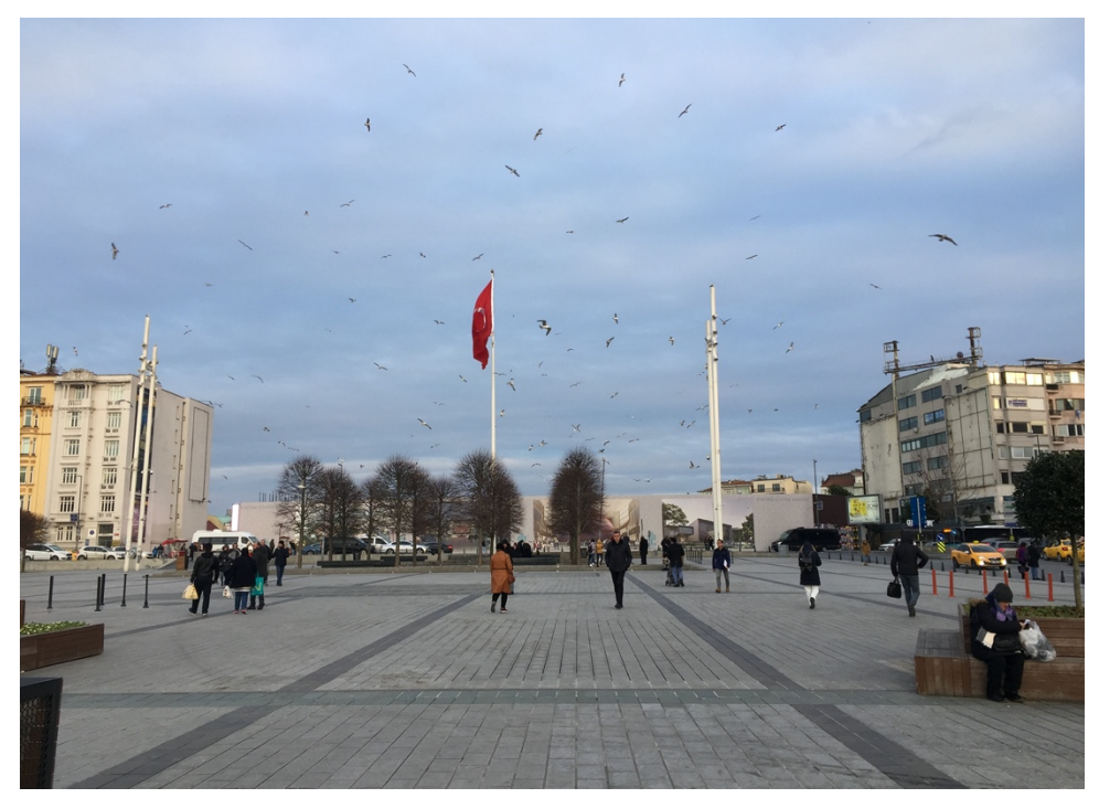
Figure 6 Taksim Square, facing the now empty Atatürk Cultural Center, 2019.

(Cumhuriyet Halk Partisi, Republican People's Party). In February 2020 the Istanbul Metropolitan Municipality partnered with the Istanbul Research Center for an Urban Design Competition for Taksim Square. A temporary structure, named "Kavuşma Durağı" (Meeting Point), was designed and constructed in the square on February 15, but the Conservation Board decided that it had to be taken down immediately, an example of the newly established power struggle between the state and the local government over the power geometry in the square.