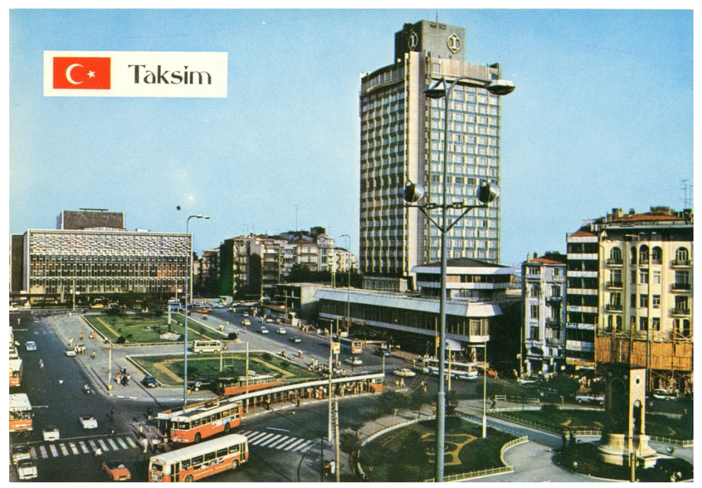
Figure 4 Atatürk Cultural Center, The Marmara and Republic Monument, 1970s.

meeting space, a memory space in the sense of Pierre Nora, for the Turkish Left and public with all the historical weight lingering in its memory.