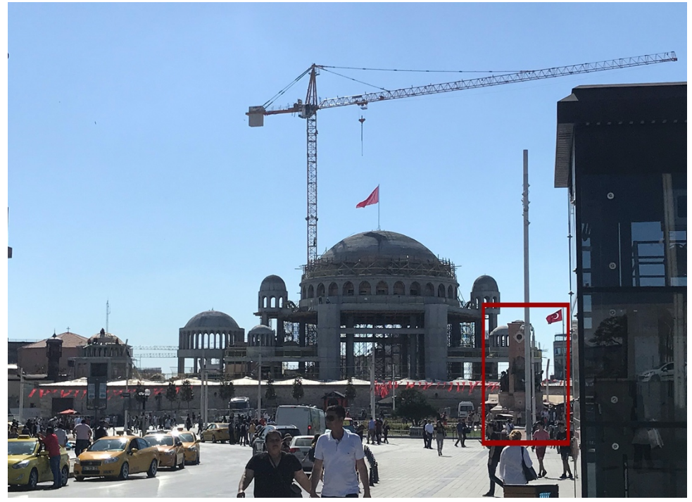
Figure 5 Construction of the Mosque with the Republic Monument (in red frame) in front, 2018.

occupation through tents and a concert was planned. The harsh police response to the protesters turned this small protest into a never-before-seen civil resistance that spread throughout Turkey, and for ten days Gezi Park and Taksim Square were occupied by thousands of circulating Istanbulites. The Gezi Park Incident, as it is called, ended with police intervention.<sup>47</sup>