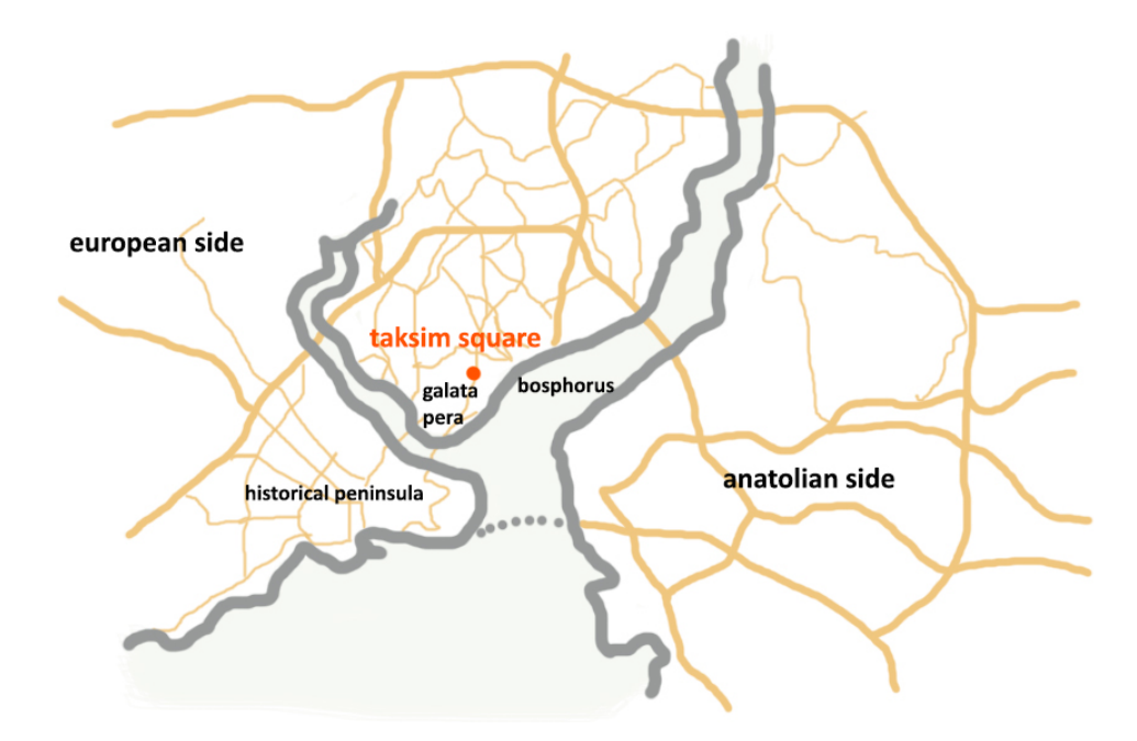
Figure 1 Taksim Square.

that are charged with different meanings for its residents. Taksim Square, as we explain while recounting its history, is this kind of space. It is a public space meaningful not only for residents of Istanbul but for the whole of Turkey, as the stage of important events that defined the historical arc of the country. Thus the present essay aims to read the power geometry that takes place there in a nonlinear historical way, which would comply with the dynamism of the space. The phases, which triggered the different geometric relations throughout the history of the power struggle on the square, are examined and correlated in the framework of Bourdieu's concepts of capital.