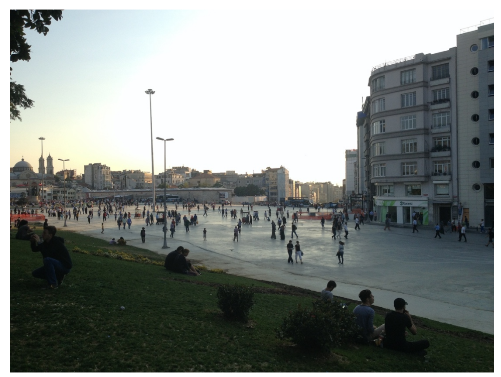
Figure 8 Picture of the pedestrian square from the Kurtulus Direction, 2013.

While this essay was being prepared for publication, in March 2020, the Istanbul Metropolitan Municipality launched another urban design project competition for a project called "Square for Everyone and Everything." The project aims to organize the square according to contemporary principles to create an urban public space experience that embraces the sensitivities of every faction of the society.<sup>51</sup> The competition invites its participants to a collective thought process for proposals with an approach that is contemporary and values cultural memory. Whether the proposals are going to overlap with the intentions of the competition is a bold step as a comprehensive plan for the square, the first one since Prost's.