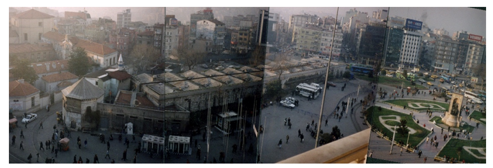
Figure 3 Taksim Square, 2003.