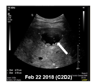
Figure 1 Images from ultrasound-guided injection of MEDI9197 into liver metastases during cycle 1 (A) and cycle 2 (B) in a patient who died of hemorrhagic shock 4 days after receiving his second injection. Note the cystic appearance of the injected lesion (arrow) at cycle 2, day 2.

doses in subcutaneous or cutaneous lesions demonstrated significant changes in gene expression levels 24 hours (1429 upregulated and 2269 downregulated genes) and 1 week (557 upregulated and 201 downregulated genes) after injection (online supplemental figure S6 and table S6). Increases in Th1 and type 1 IFN gene expression signatures and a transient decrease in CD8A transcript and NK cell signature expression suggested trafficking of T and NK cells (online supplemental figure S7A–D). Similar effects were seen when MEDI9197 was administered in combination with durvalumab (online supplemental figure S7E–H).