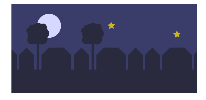
Figure 1: A scene for which multiple spatial relations may naturally be used to refer to an object.

Through what kind of neural processes may the brain bring about the perceptual grounding of sets of phrases that invoke concepts and relations? Earlier modeling work proposed the component processes that enable the grounding of an individual relation between a pair of objects (e.g., "A above B", where "A" is the target and "B" the reference object; Lipinski, Schneegans, Sandamirskaya, Spencer, & Schöner, 2012; Richter, Lins, Schneegans, Sandamirskaya, & Schöner, 2014;