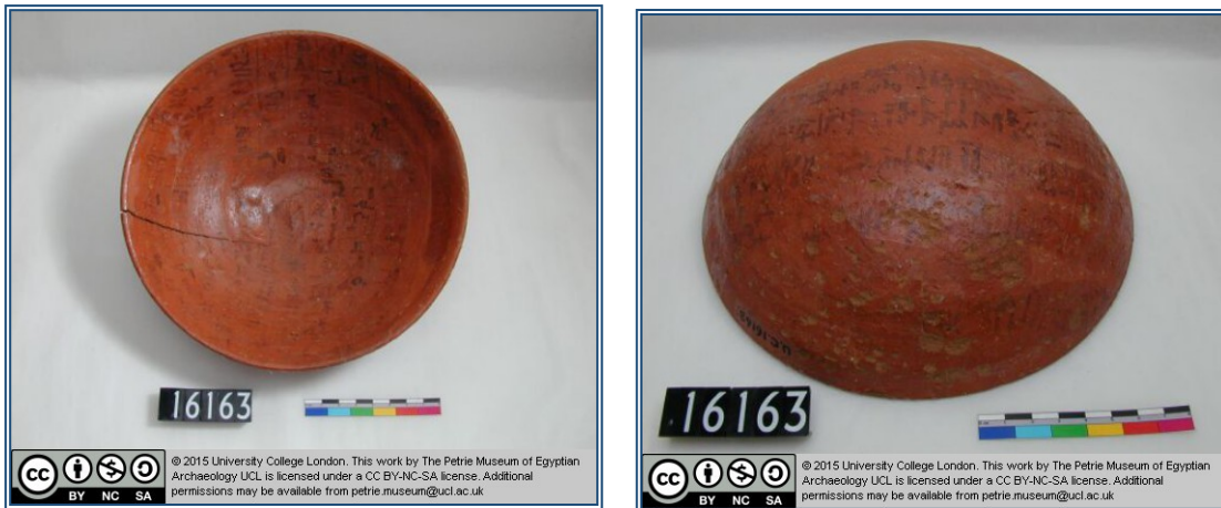
Figure 1. The Qau Bowl: interior and exterior.