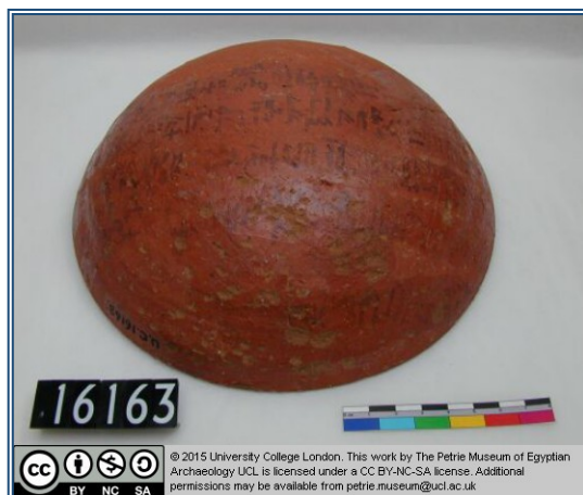
Figure 1. The Qau Bowl: interior and exterior.